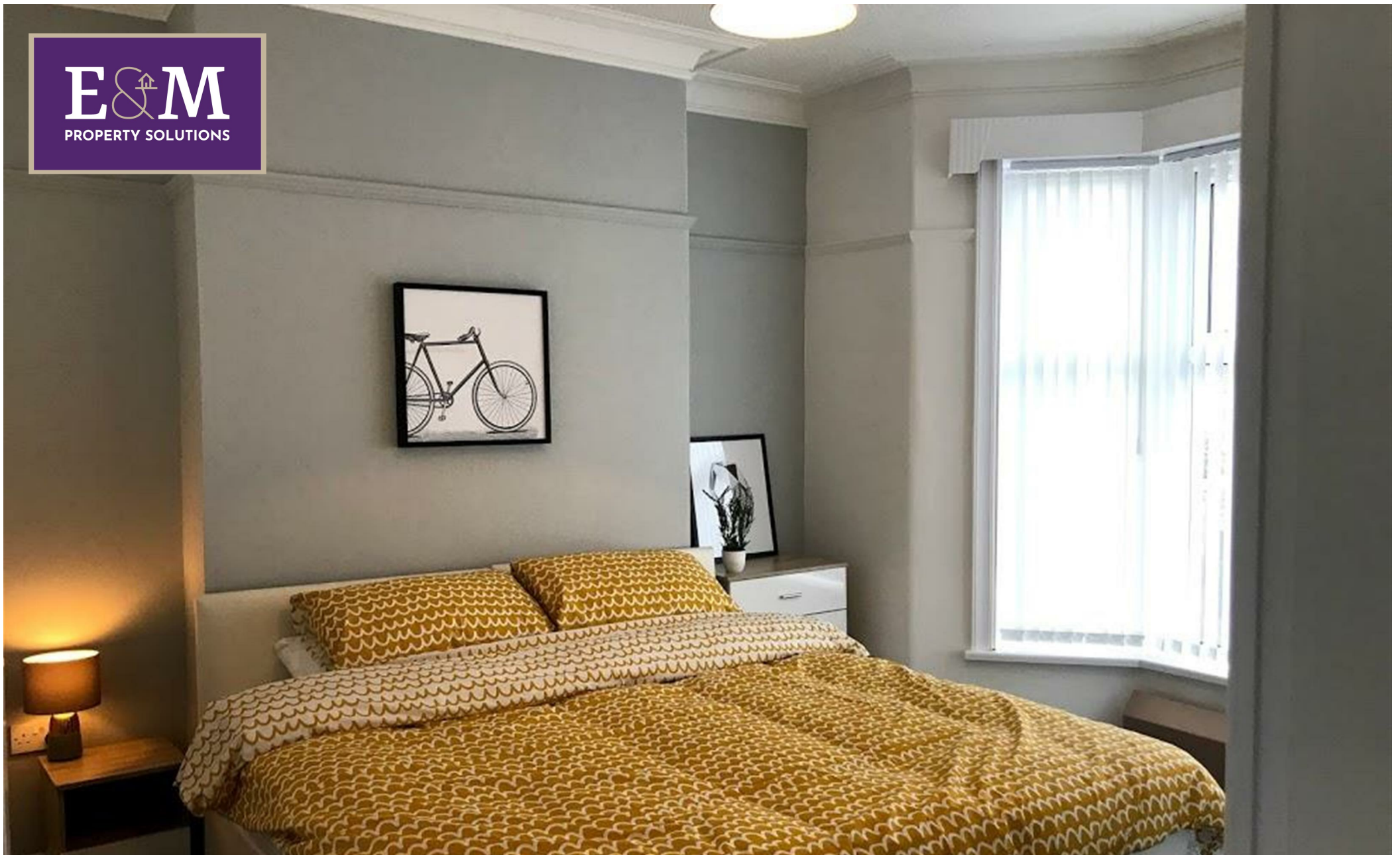
Room 4, 227 Coal Clough Lane, Burnley, Lancashire, BB11 4DL £90 Per week