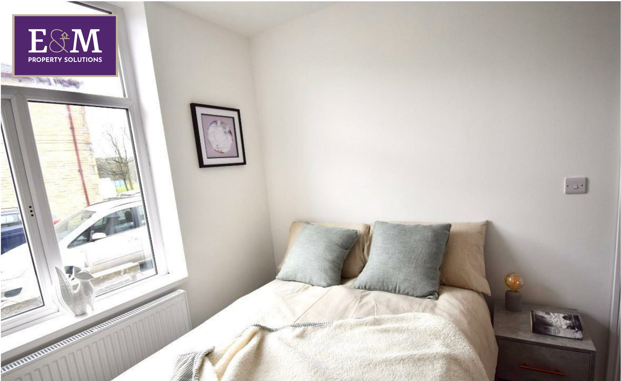
Room 1, 4 Brockenhurst Street, Burnley, Lancashire, BB10 4ET £412 Per week