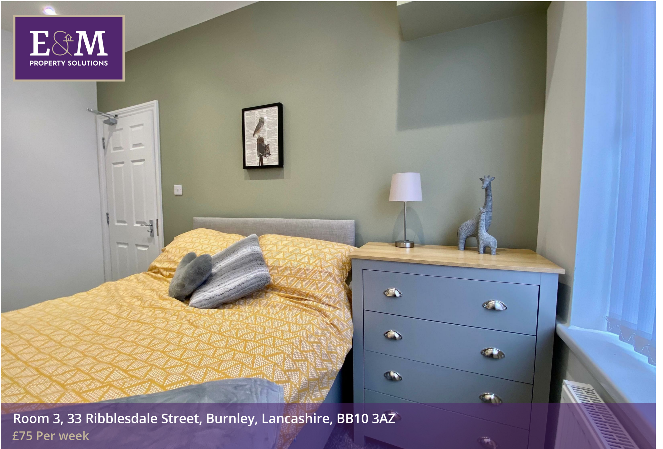
Room 3, 33 Ribblesdale Street, Burnley, Lancashire, BB10 3AZ £75 Per week