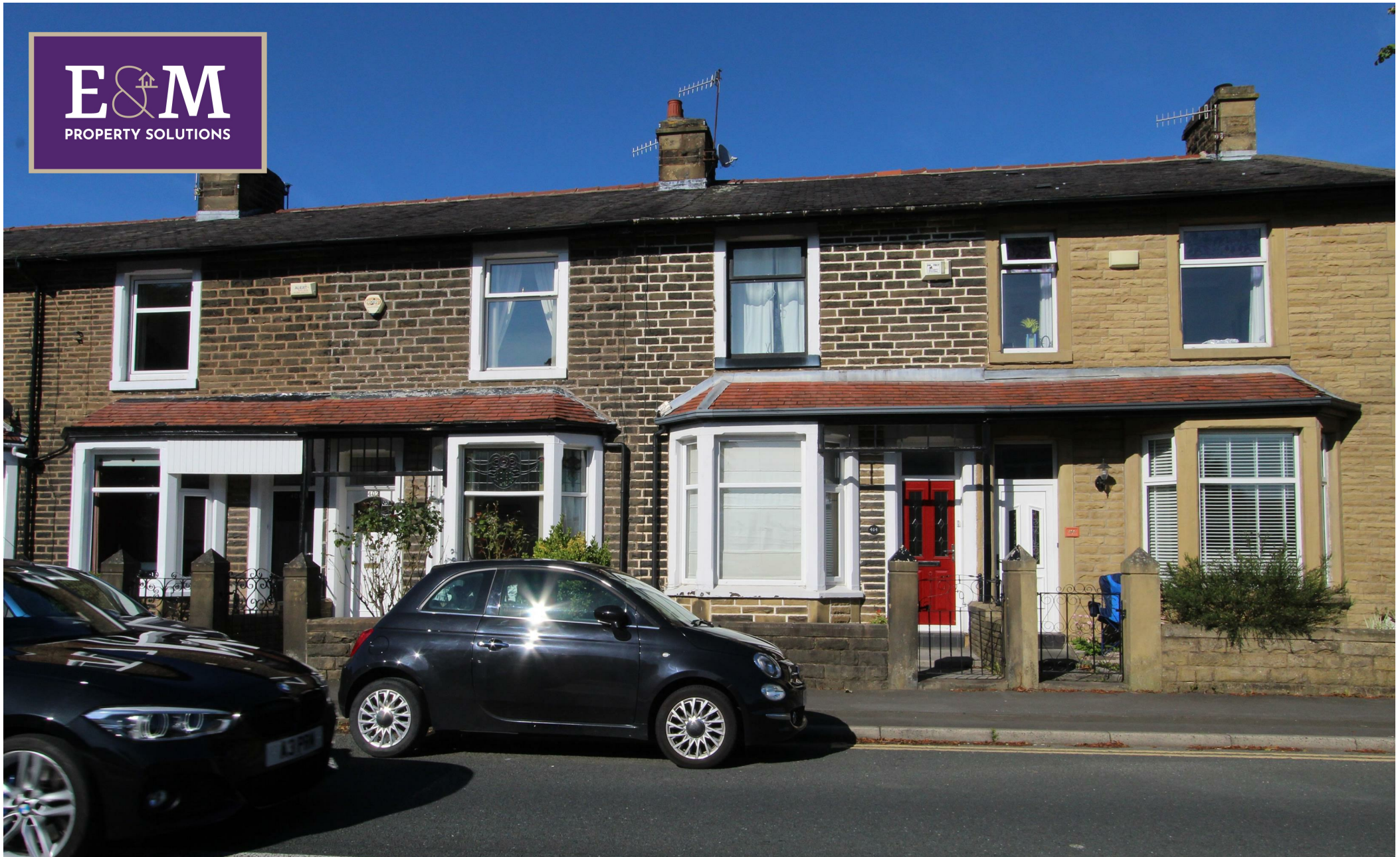
404 Brunshaw Road, Burnley, Lancashire, BB10 3HX Asking price £119,995