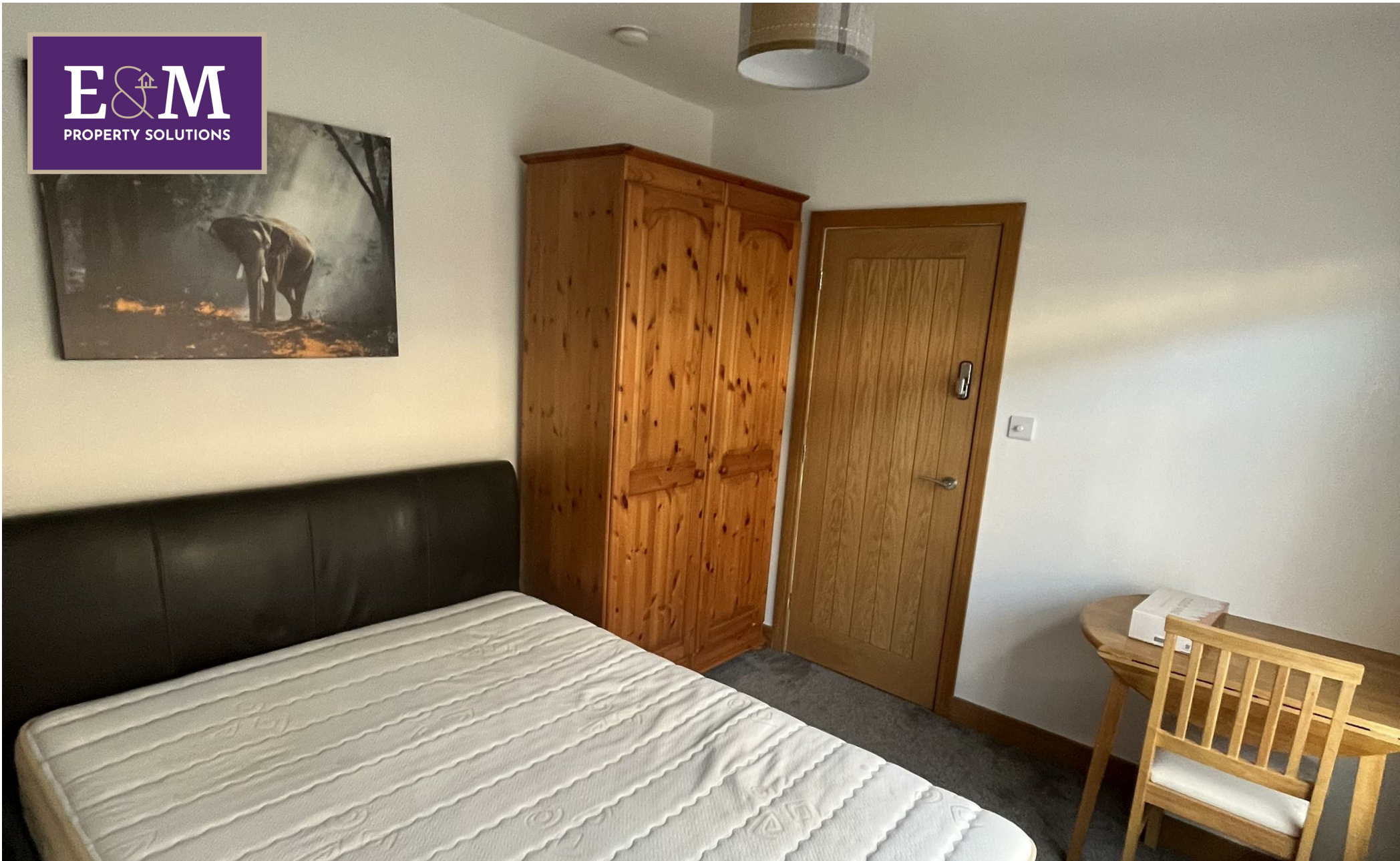
room 1, 40 Herbert Street, Burnley, Lancashire, BB11 4JX £95 Per week