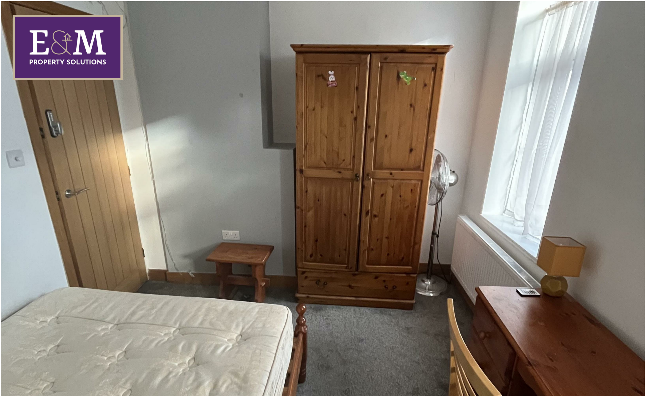
ROOM 3, 40 Herbert Street, Burnley, Lancashire, BB11 4JX £125 Per week