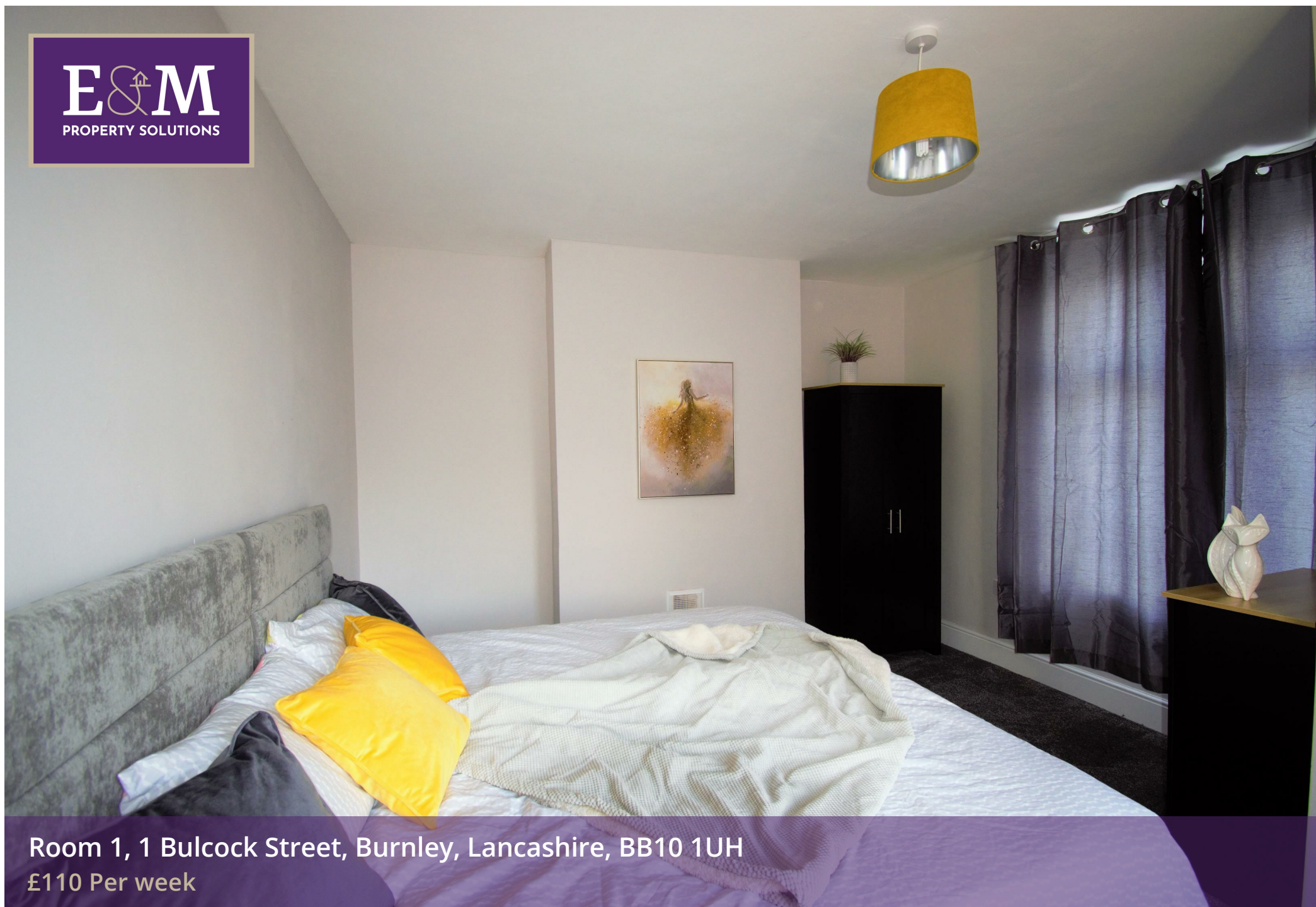
Room 1, 1 Bulcock Street, Burnley, Lancashire, BB10 1UH £110 Per week