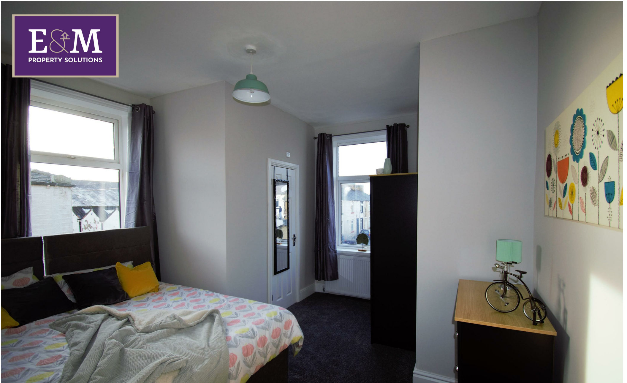
Room 2, 1 Bulcock Street, Burnley, Lancashire, BB10 1UH £140 Per week