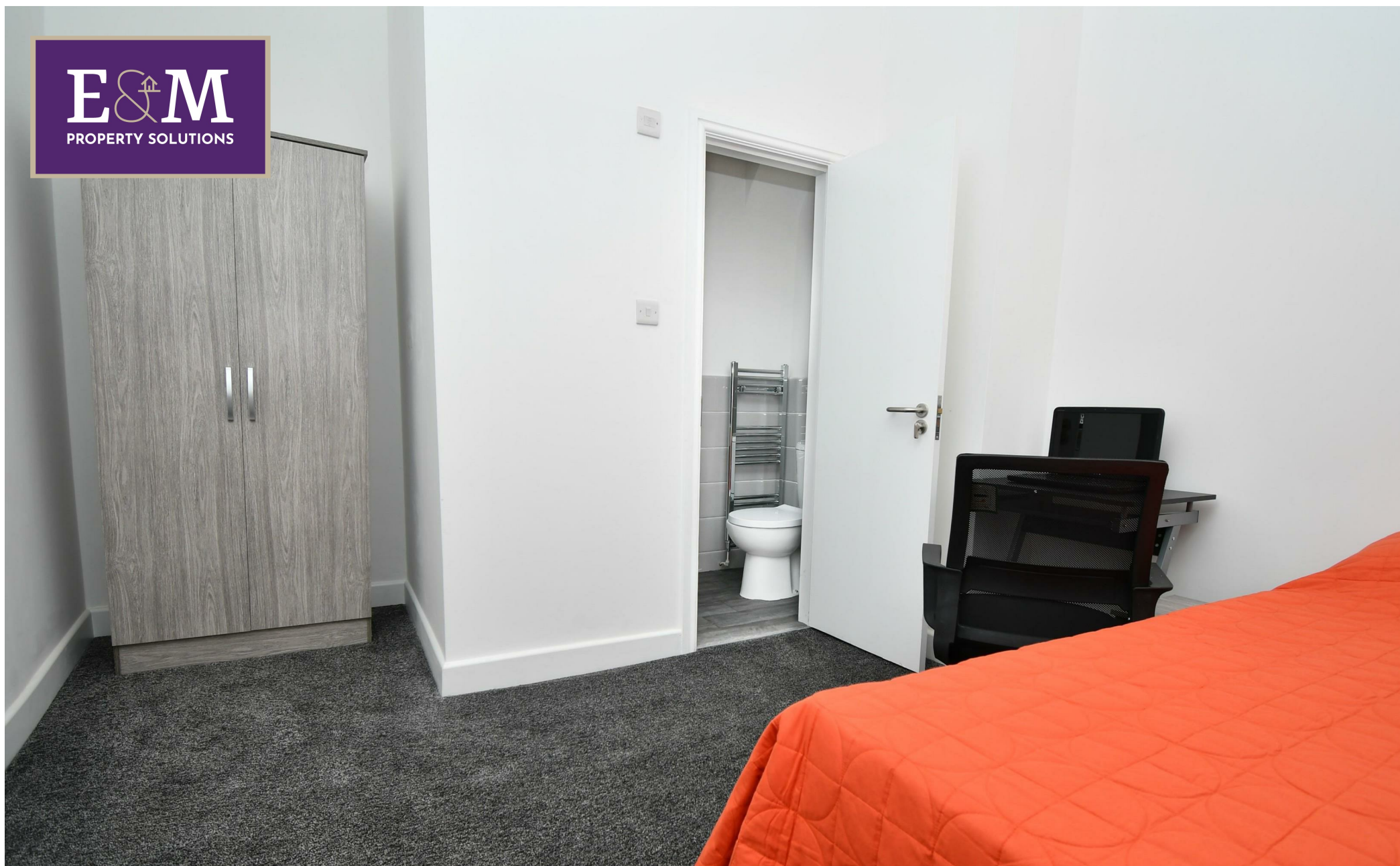
Room 1, 20 Christ Church Street, Preston, Lancashire, PR1 8PJ £125 Per week