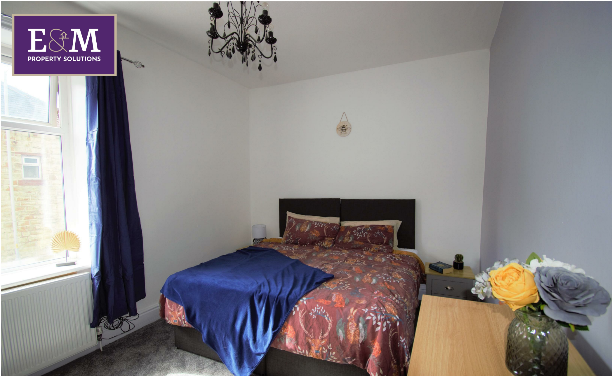
Room 2, 5 Thompson Street, Padiham, Burnley, Lancashire, BB12 7AP £95 Per week