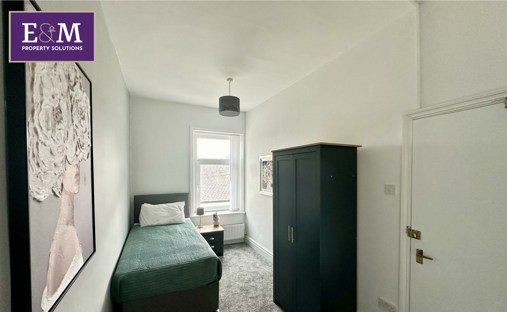
Room 3, 5 Thompson Street, Padiham, Burnley, Lancashire, BB12 7AP £95 Per week