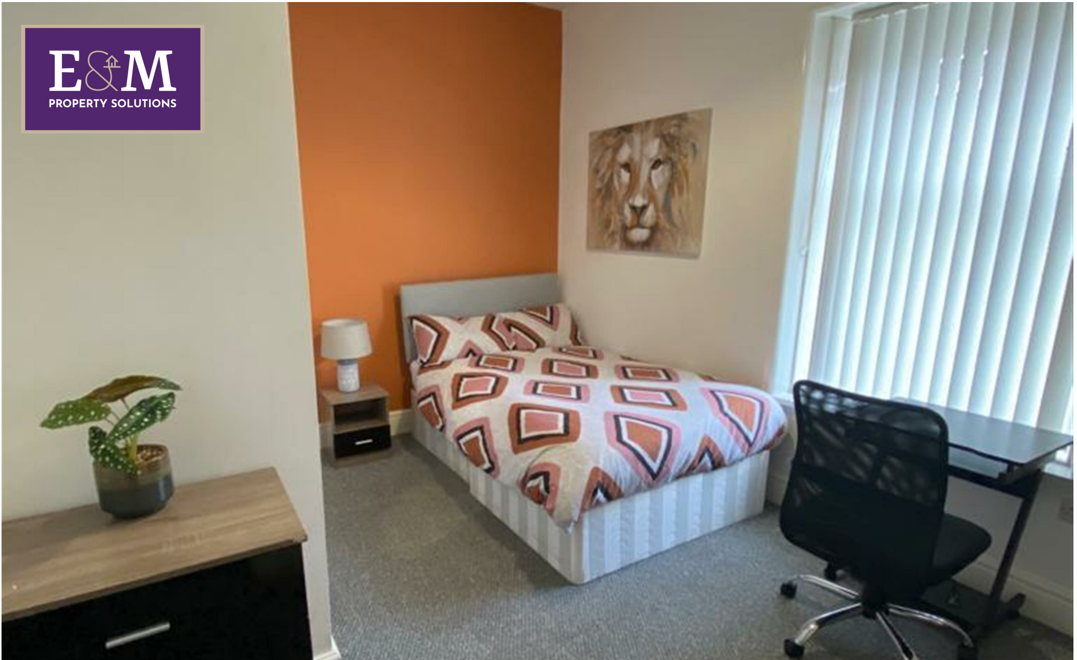
Room 3, 37 Albert Street, Burnley, Lancashire, BB11 3DB £110 Per week