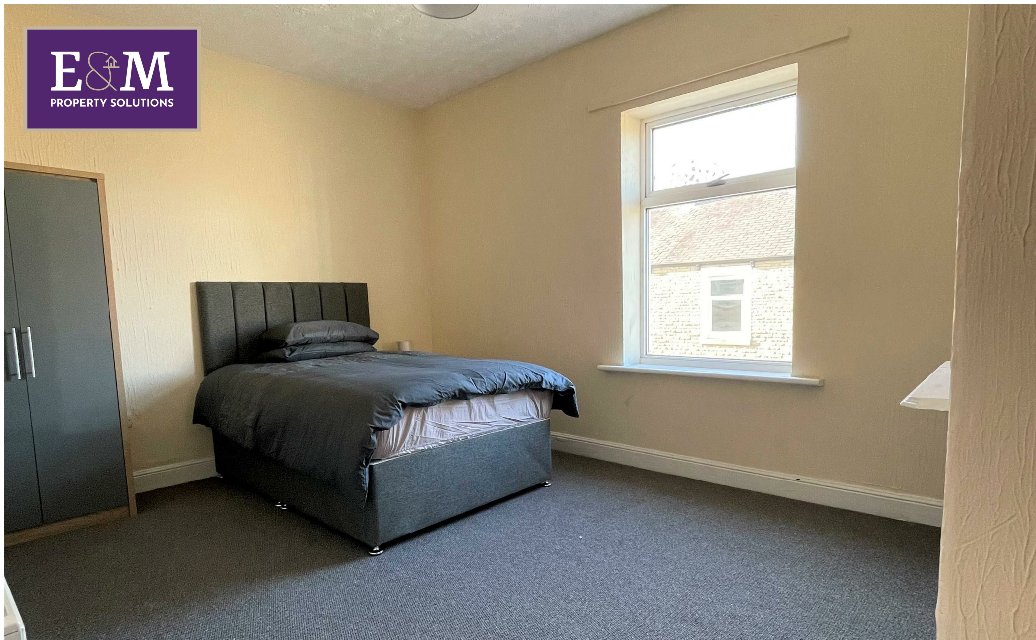
Room 2, 108 Nairne Street, Burnley, Lancashire, BB11 4PD £130 Per week