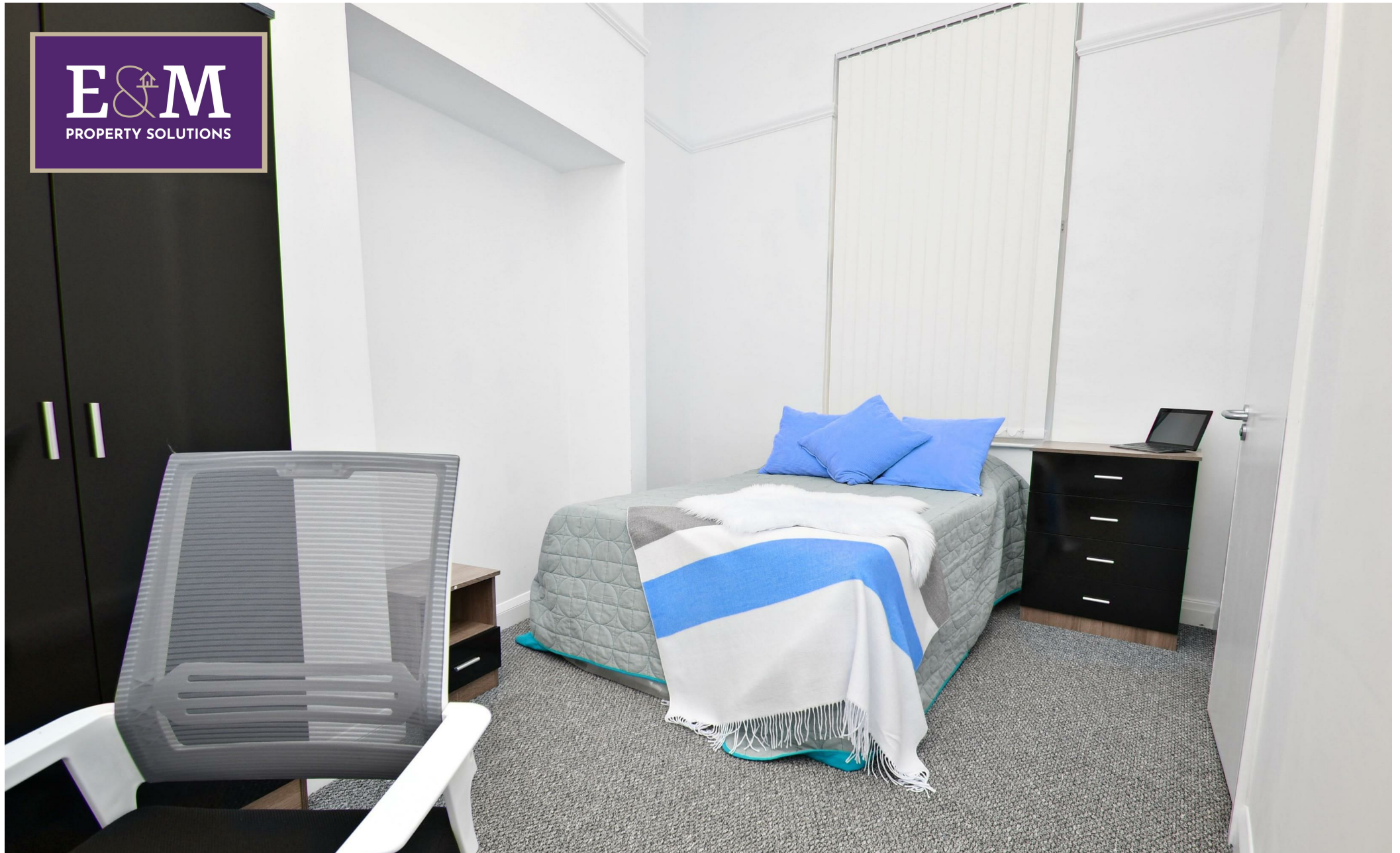
Room 5, 4 Christian Road, Preston, Lancashire, PR1 8NB £120 Per week