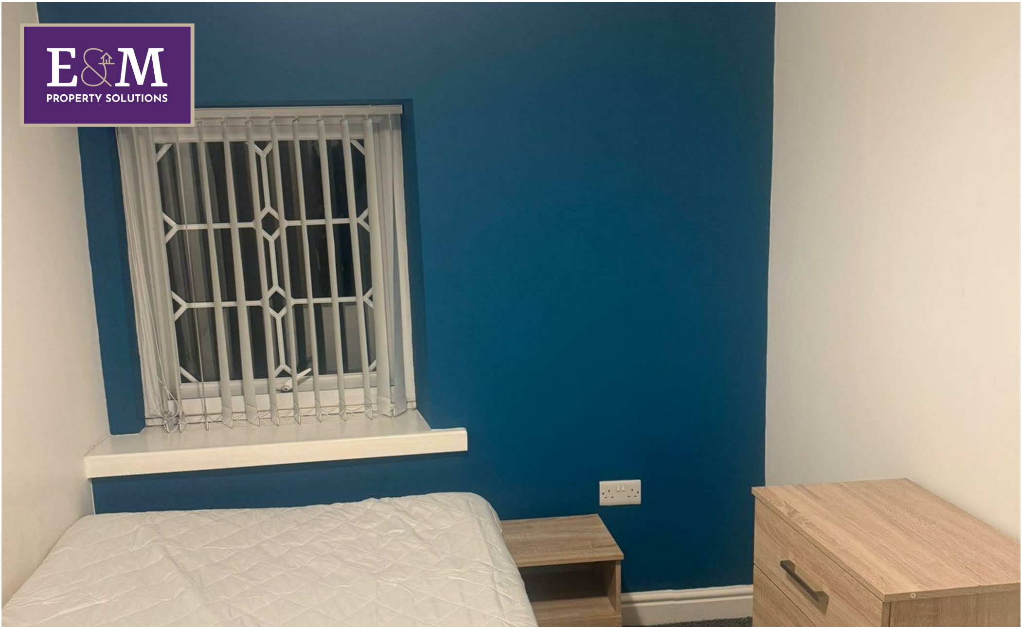
Room 2, 1 Gawthorpe Street, Burnley, Lancashire, BB12 8HP £95 Per week