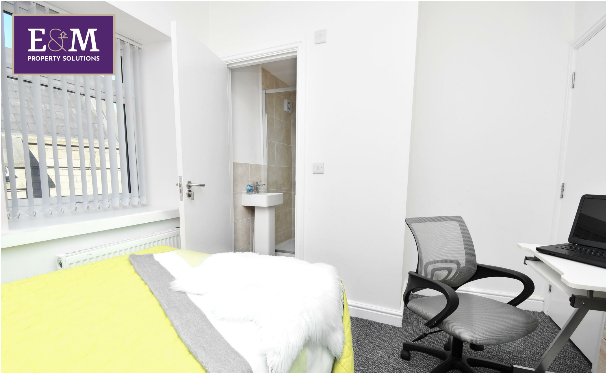
Room 3, 1 Gawthorpe Street, Burnley, Lancashire, BB12 8HP £95 Per week