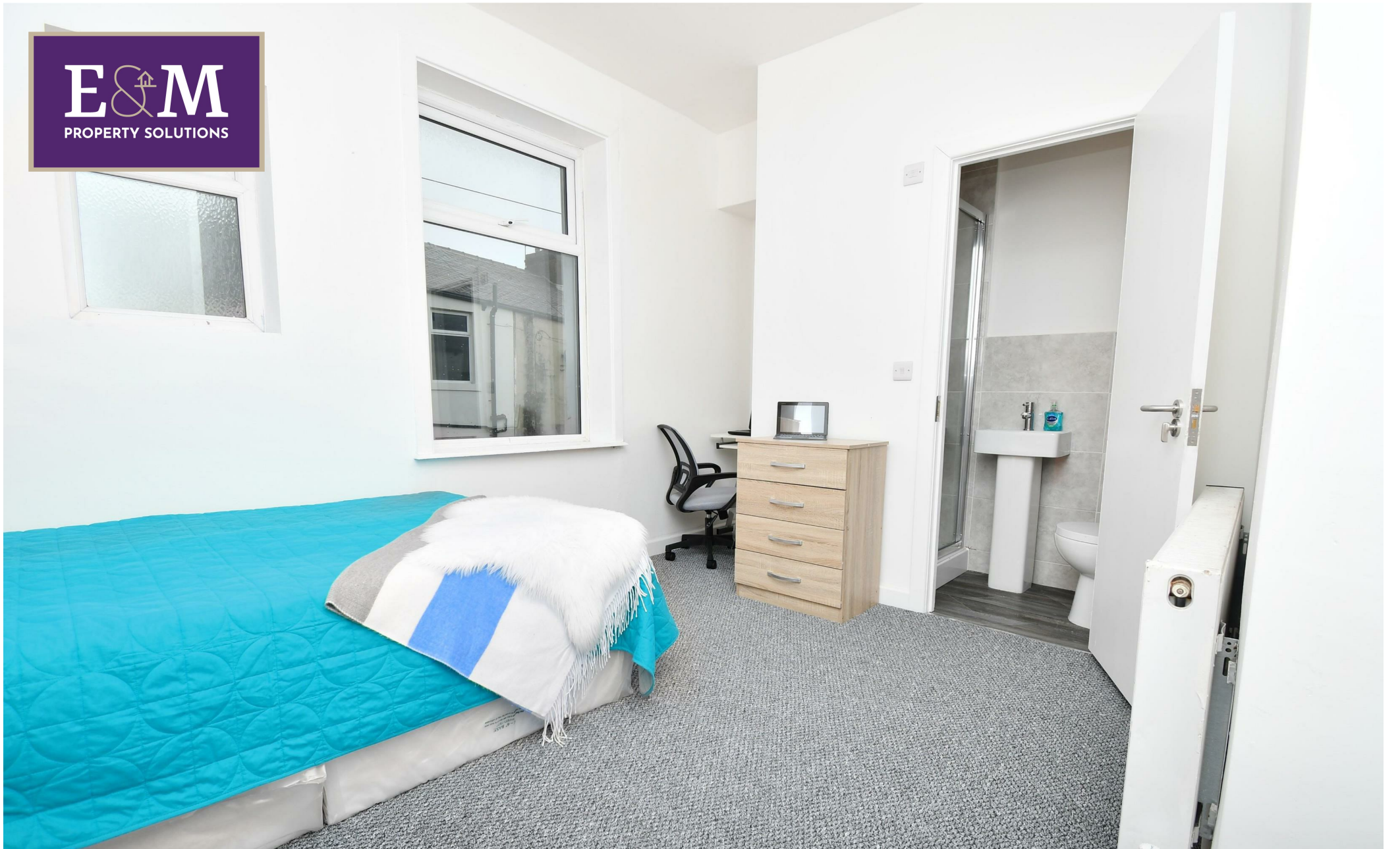
Room 3, 89 Healey Wood Road, Burnley, Lancashire, BB11 2LN £100 Per week