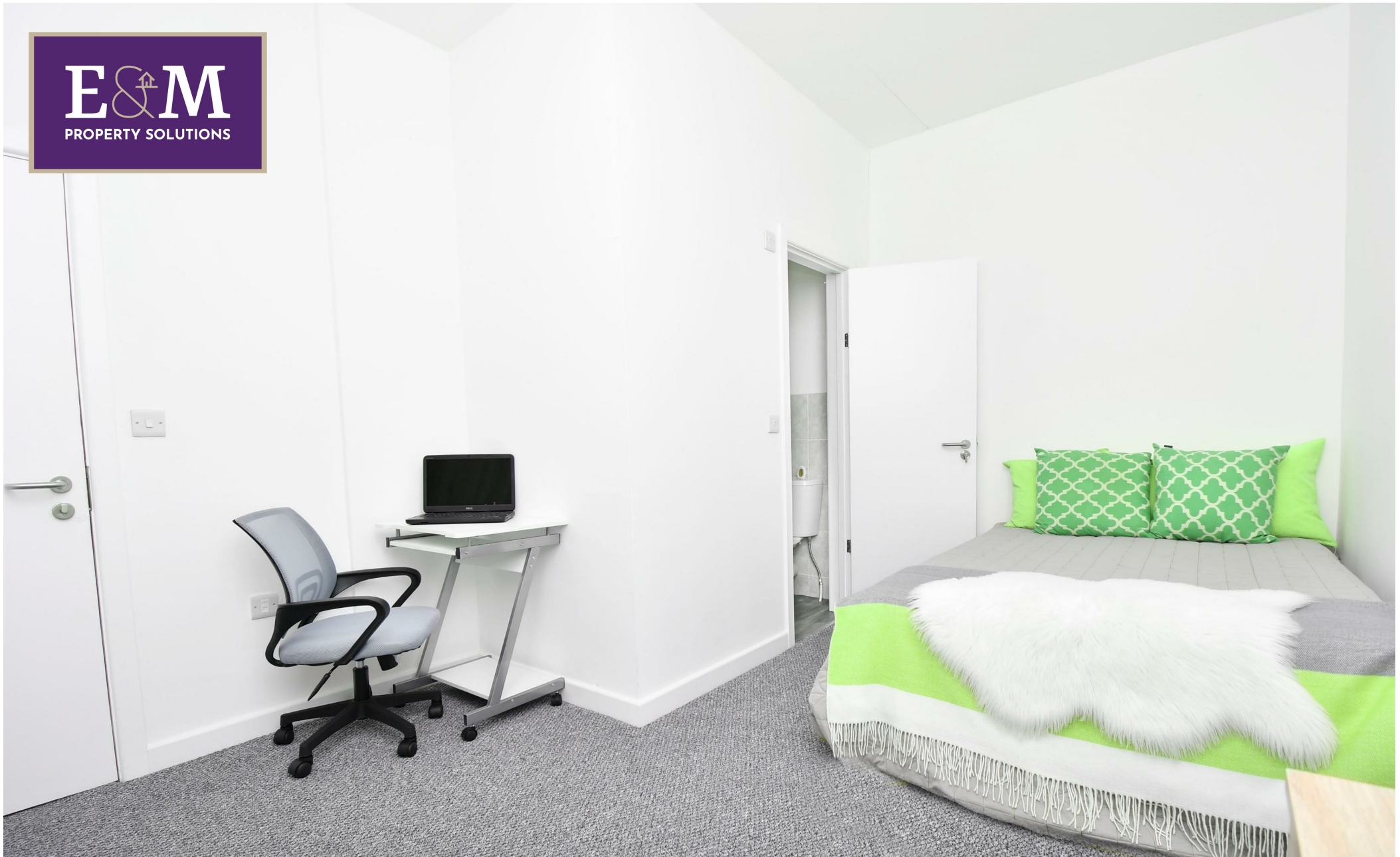
Room 4, 89 Healey Wood Road, Burnley, Lancashire, BB11 2LN £105 Per week