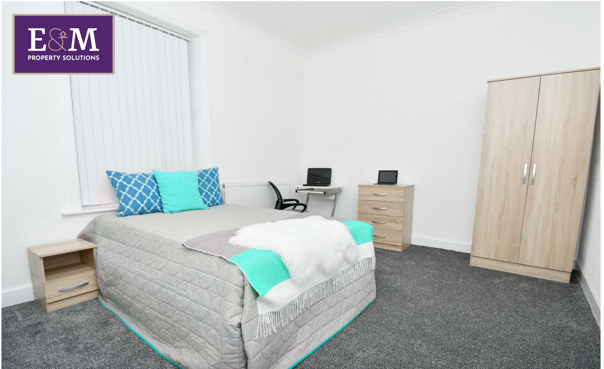
Room 2, 13 Berry Street, Burnley, Lancashire, BB11 2LG £85 Per week