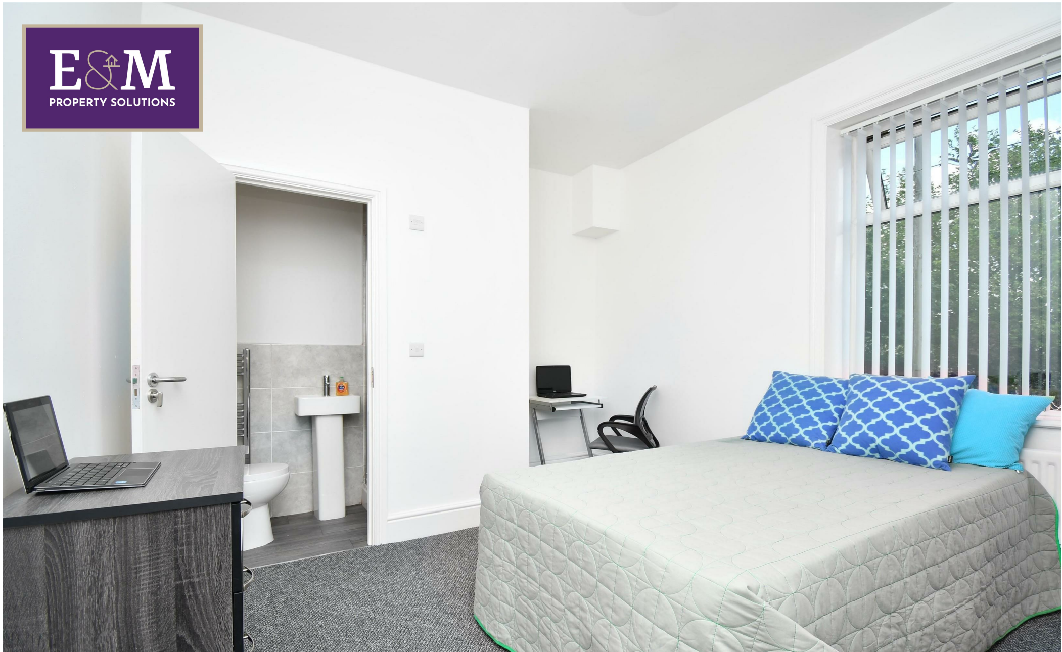
Room 3, 141 Coal Clough Lane, Burnley, Lancashire, BB11 4NW £110 Per week