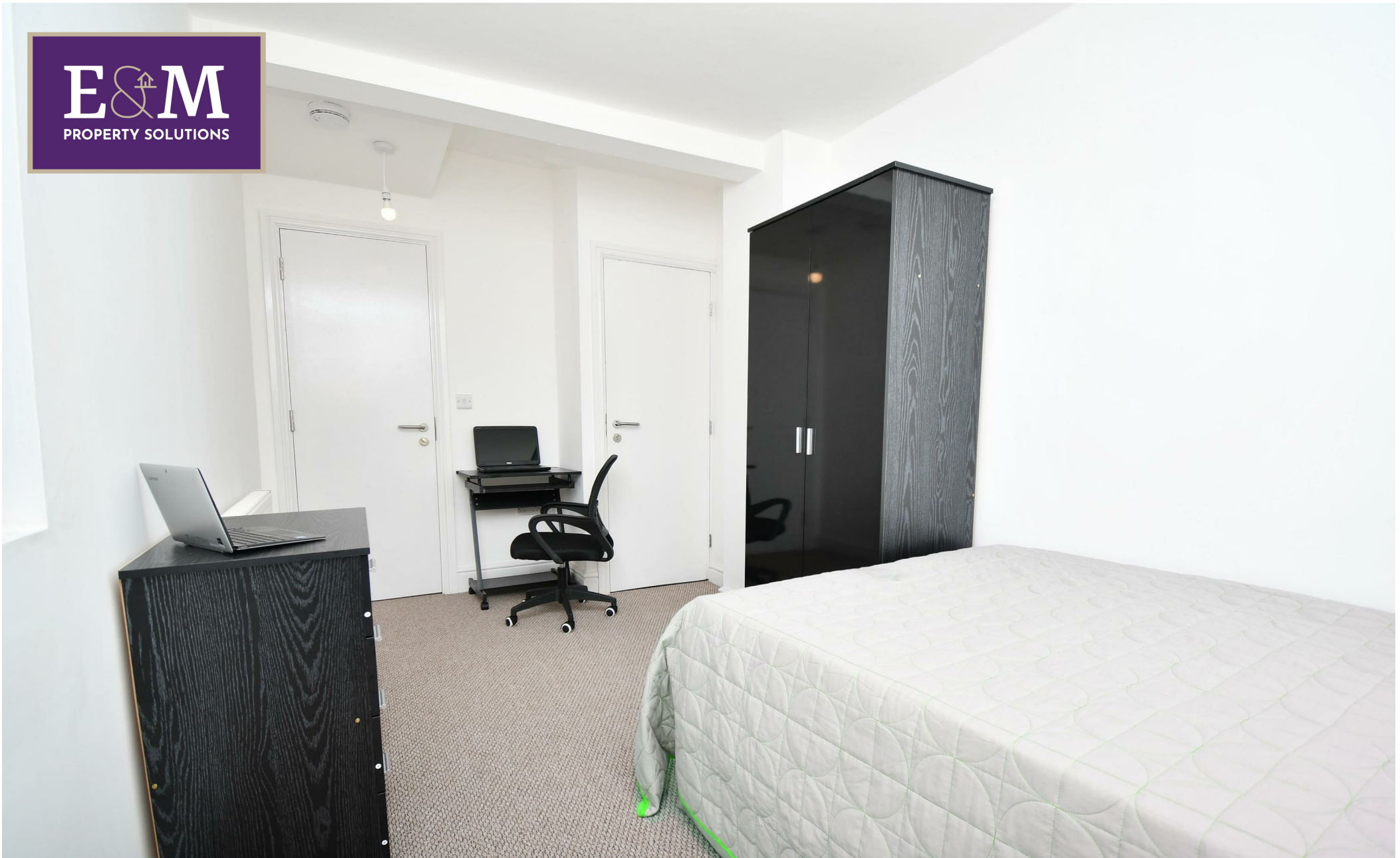
Room 4, 27 Deepdale Road, Preston, Lancashire, PR1 5AQ £115 Per week