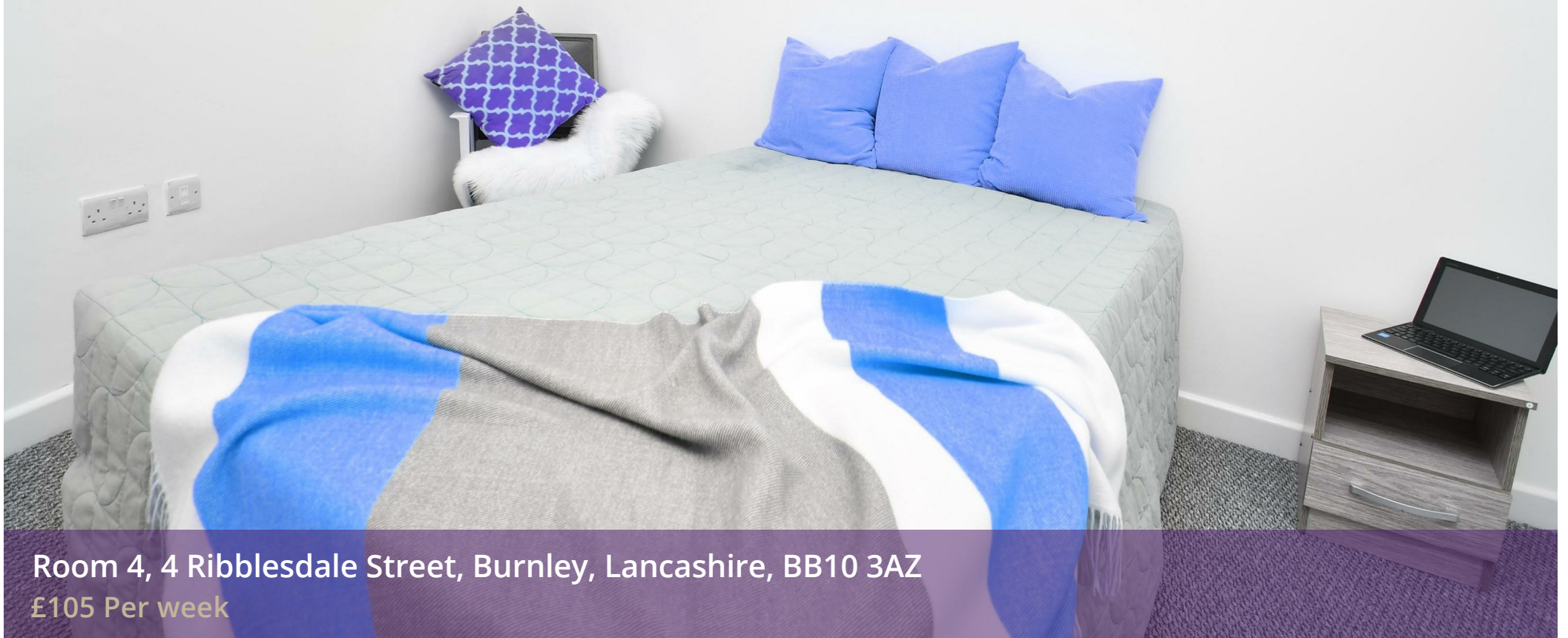
Room 4, 4 Ribblesdale Street, Burnley, Lancashire, BB10 3AZ £105 Per week