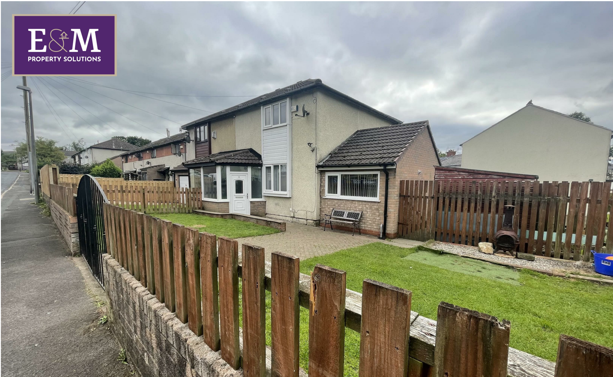
31 Cornel Grove, Burnley, Lancashire, BB11 5LB Offers in the region of £110,000