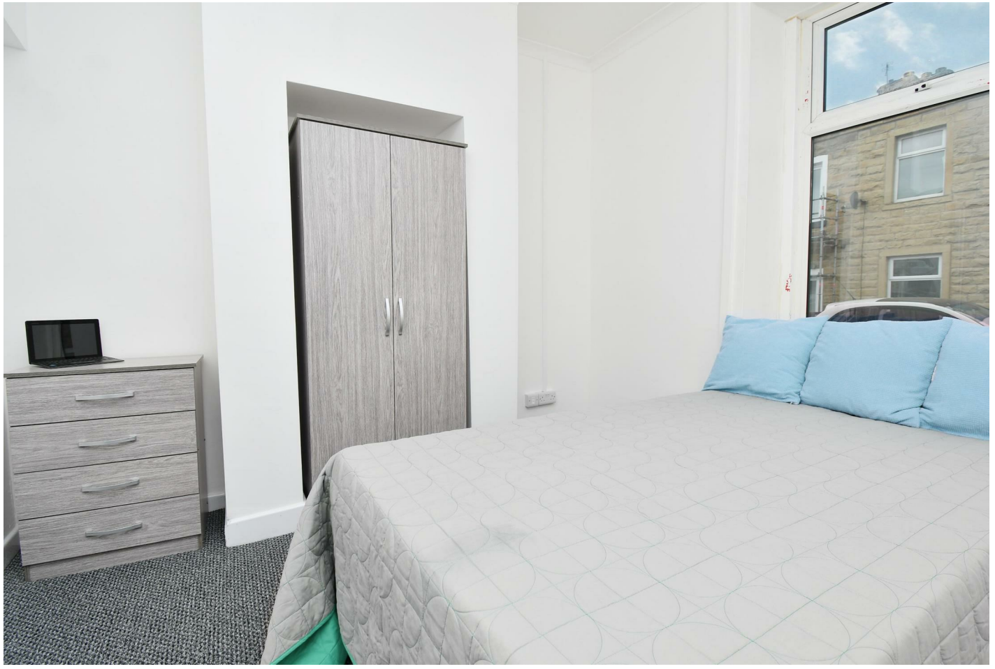
Room 3, 23 St. Annes Street, Padiham, Burnley, Lancashire, BB12 7AX