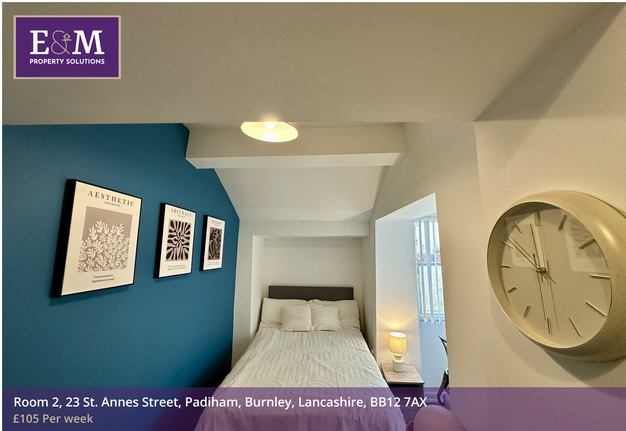
Room 2, 23 St. Annes Street, Padiham, Burnley, Lancashire, BB12 7AX £105 Per week