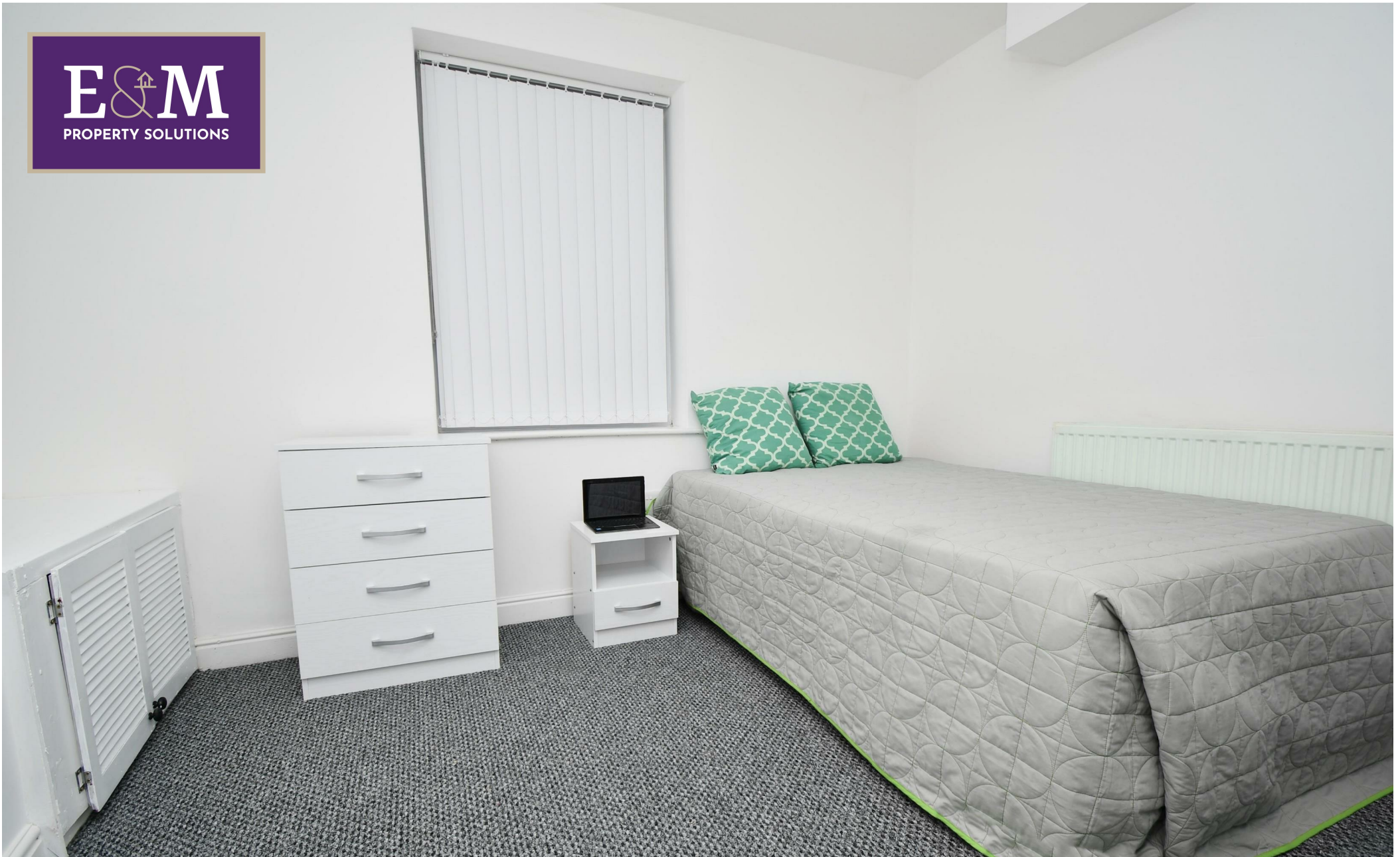
Room 3, 161a Emmanuel Street, Preston, Lancashire, PR1 7NQ £120 Per week