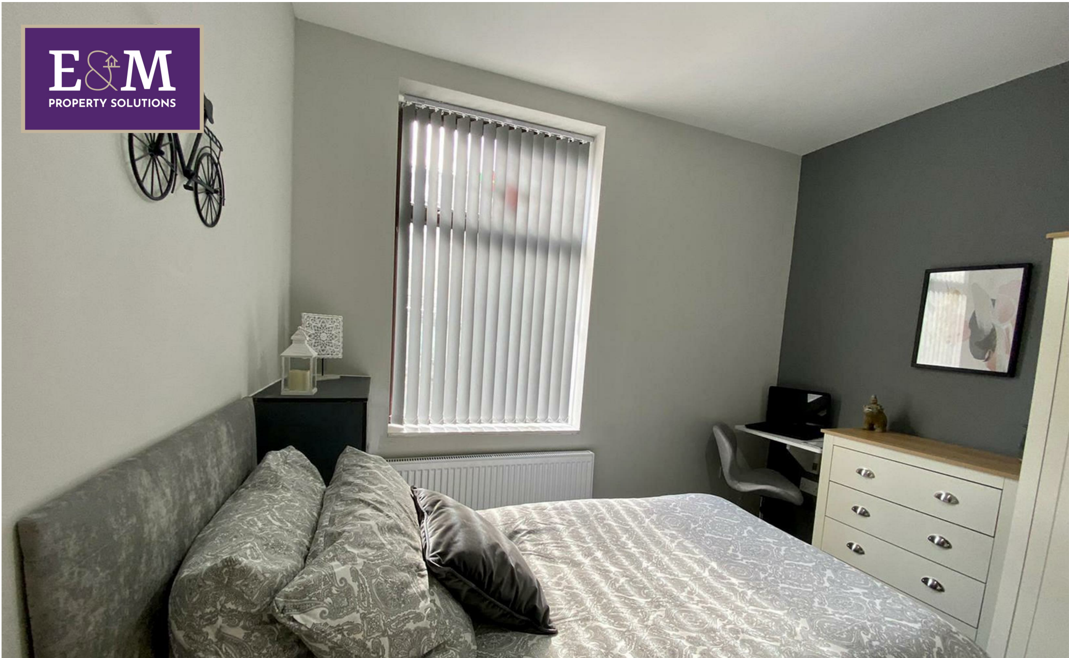
Room 1, 25 Netherby Street, Burnley, Lancashire, BB11 4NR £110 Per week