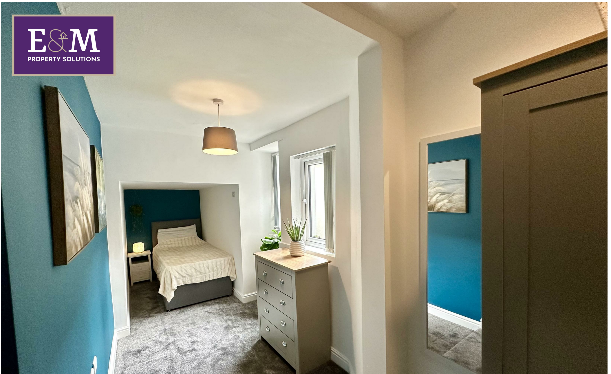
ROOM 2, 14 Lebanon Street, Burnley, Lancashire, BB10 4DF £90 Per week