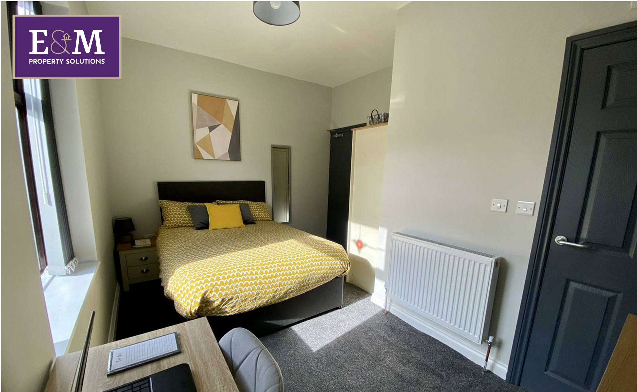
ROOM 3, 25 Netherby Street, Burnley, Lancashire, BB11 4NR £120 Per week