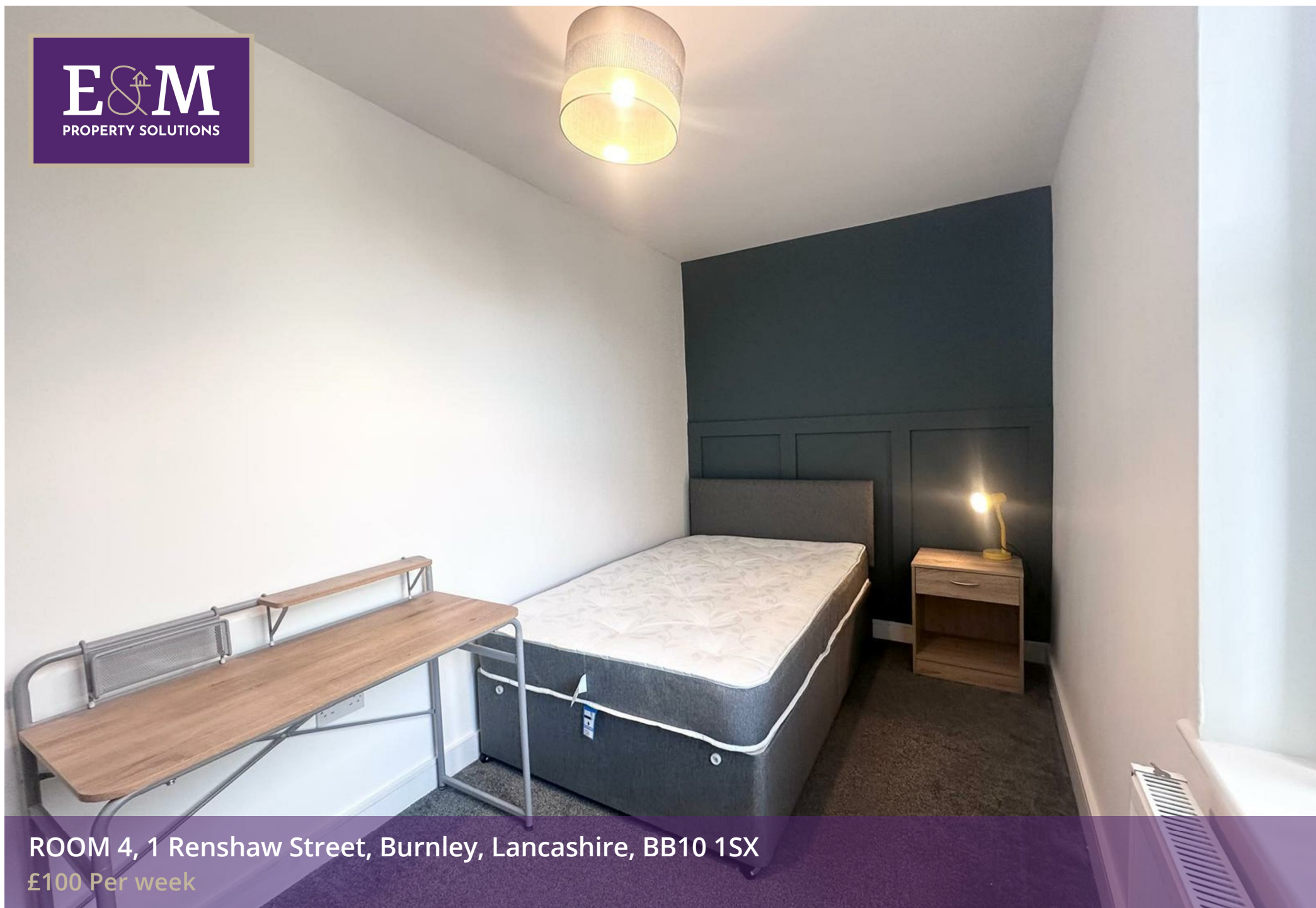
ROOM 4, 1 Renshaw Street, Burnley, Lancashire, BB10 1SX £100 Per week