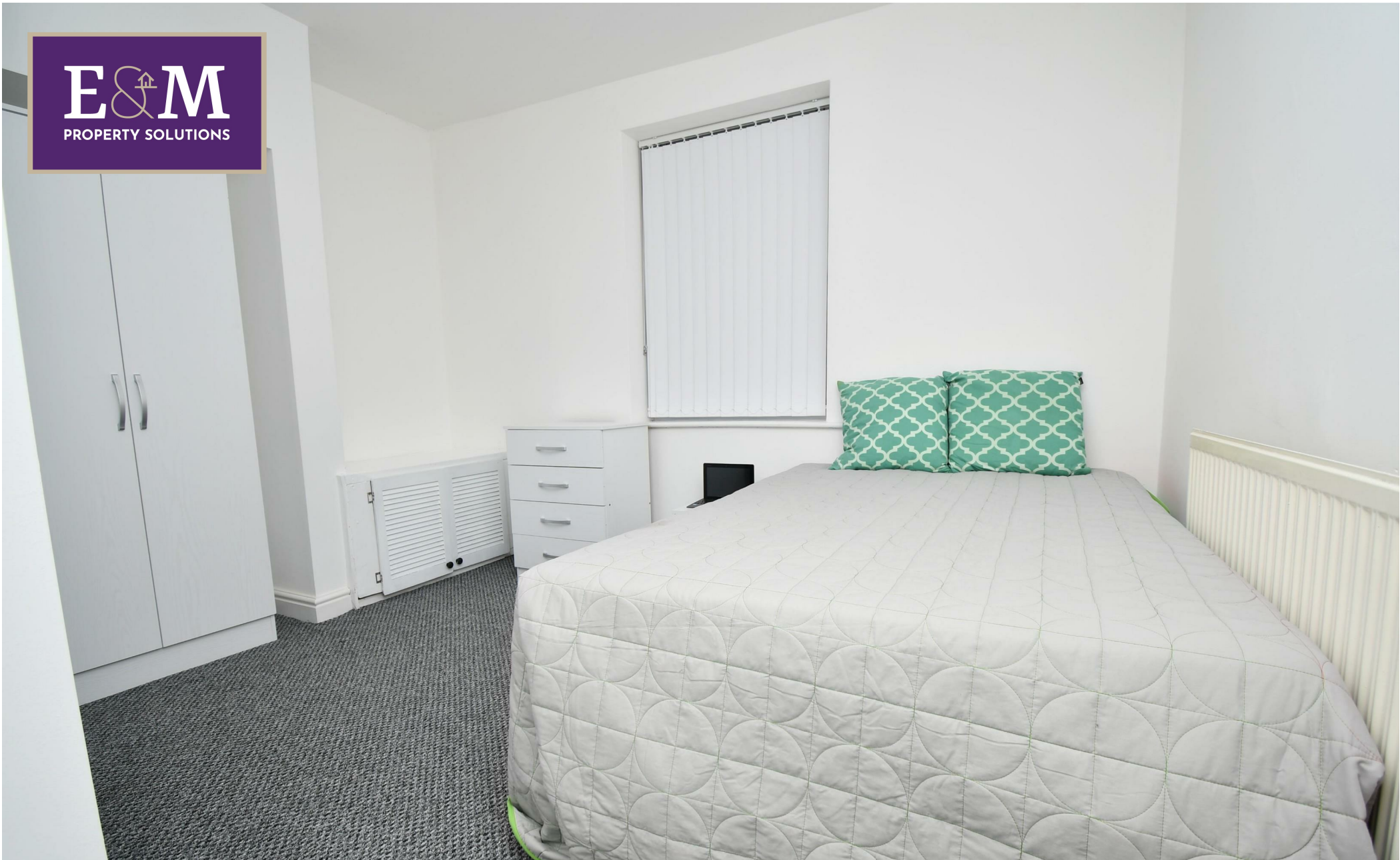
ROOM 1, 30 Kenmure Place, Preston, Lancashire, PR1 6DD £115 Per week