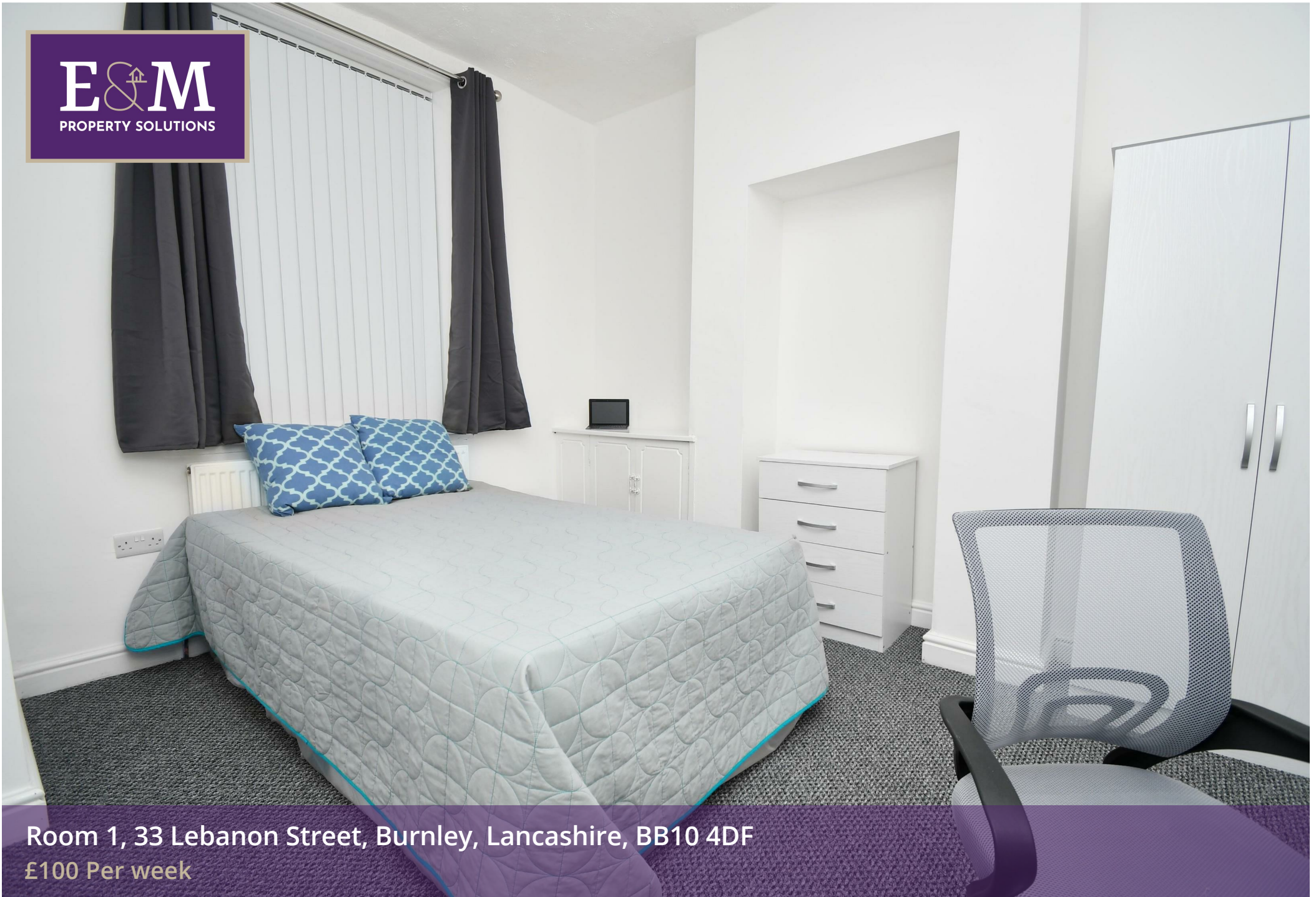
Room 1, 33 Lebanon Street, Burnley, Lancashire, BB10 4DF £100 Per week