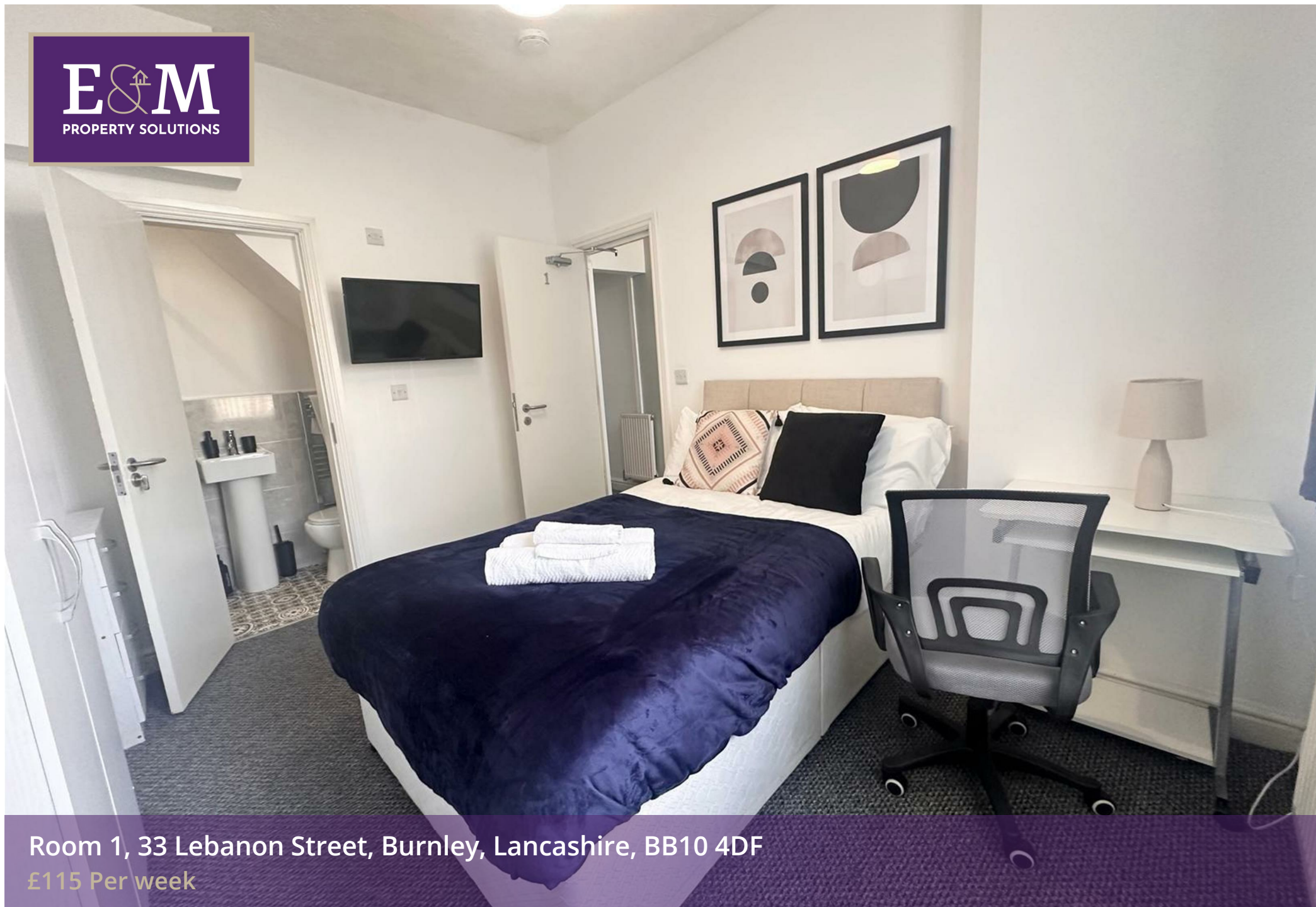
Room 1, 33 Lebanon Street, Burnley, Lancashire, BB10 4DF £115 Per week