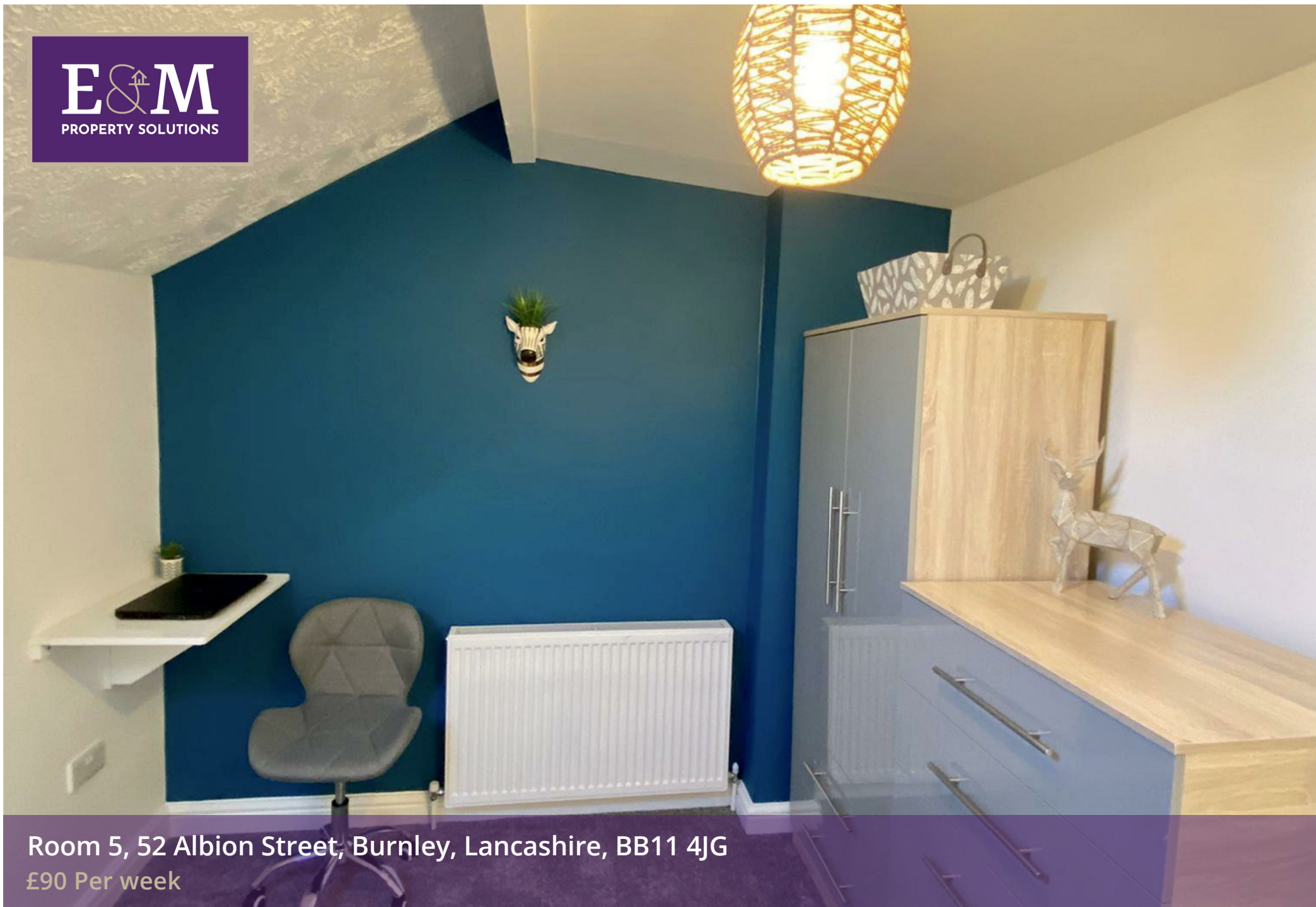
Room 5, 52 Albion Street, Burnley, Lancashire, BB11 4JG £90 Per week