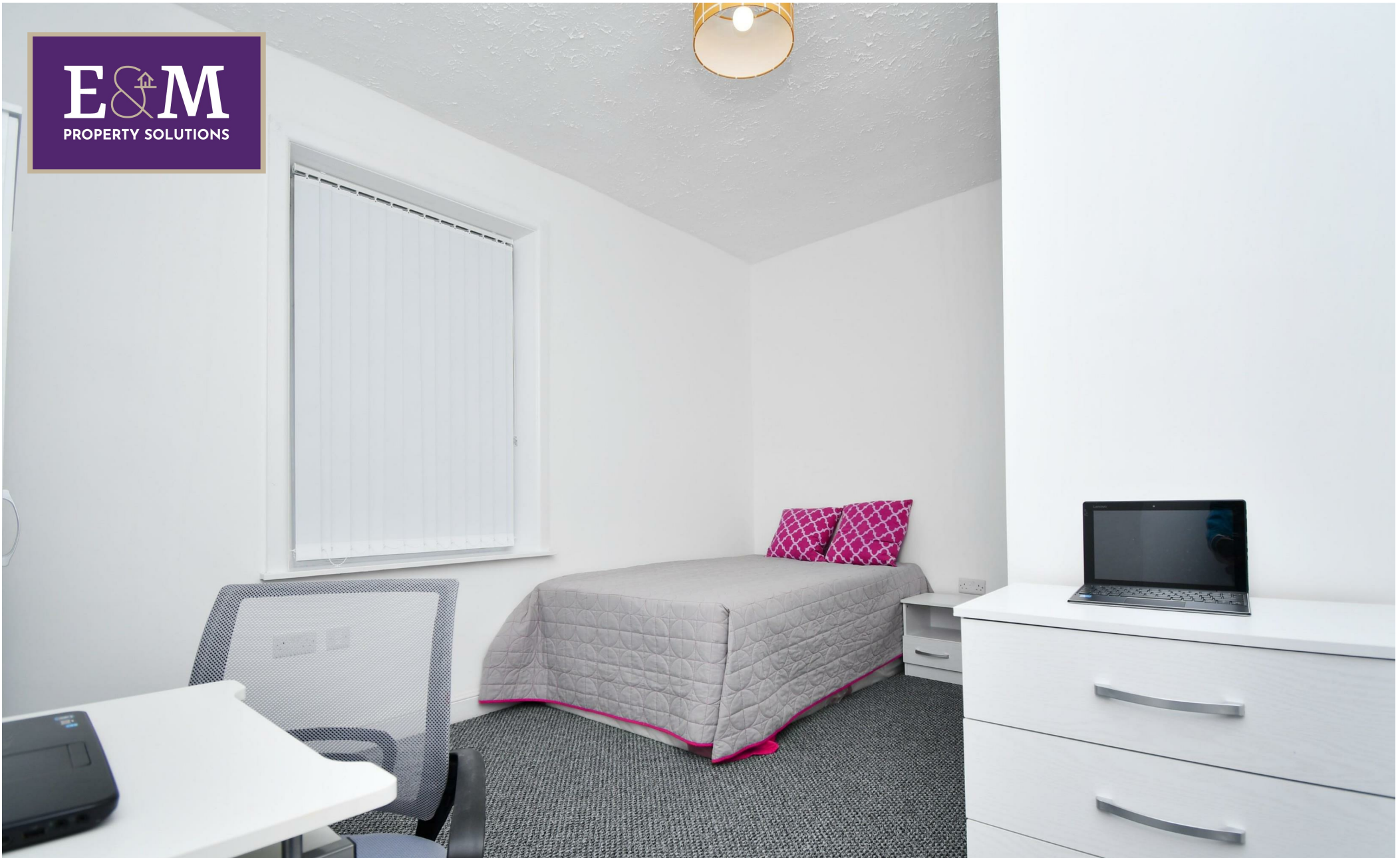
ROOM 3, 16 Linden Street, Burnley, Lancashire, BB10 4EQ £105 Per week