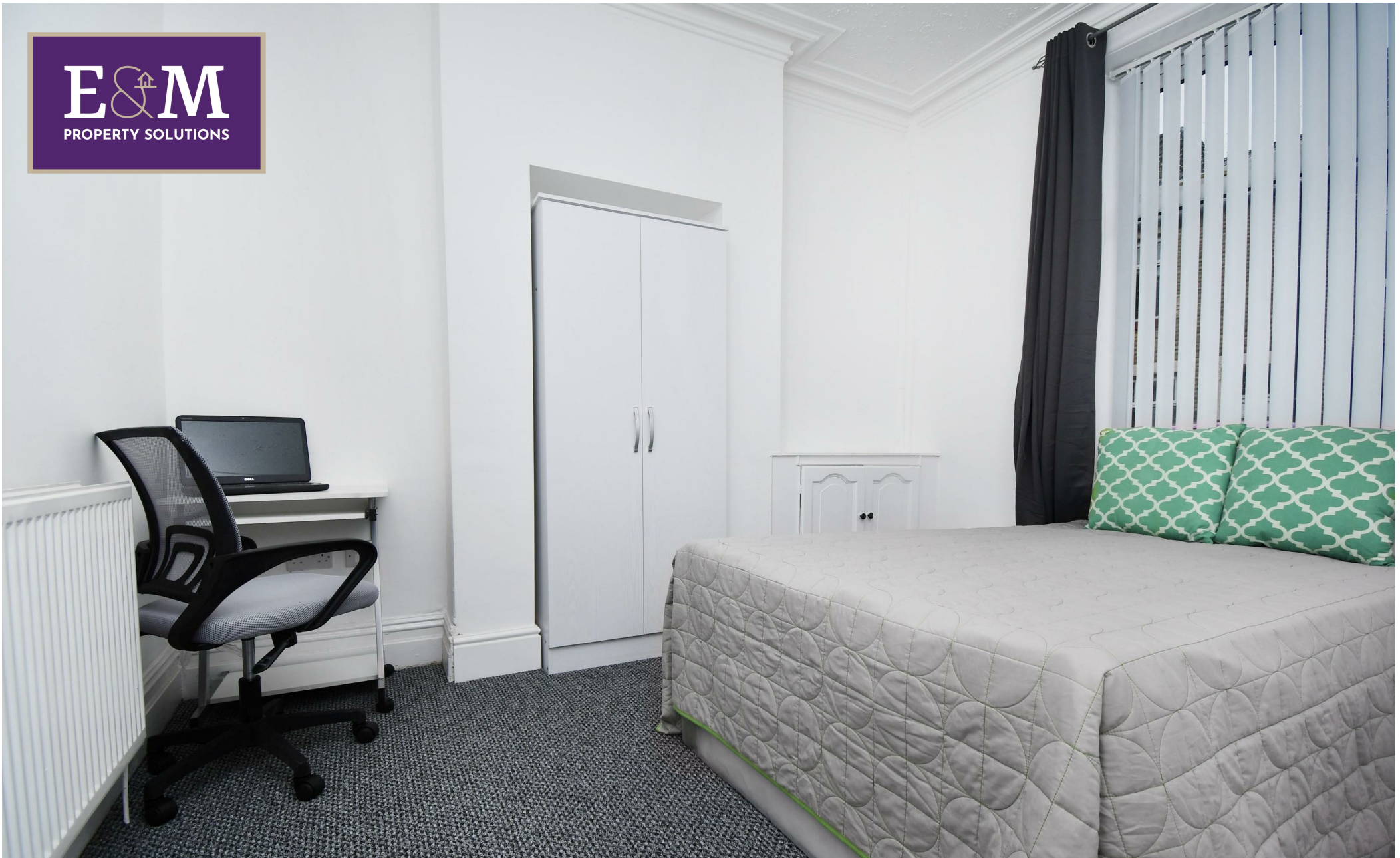
Room 1, 16 Linden Street, Burnley, Lancashire, BB10 4EQ £90 Per week