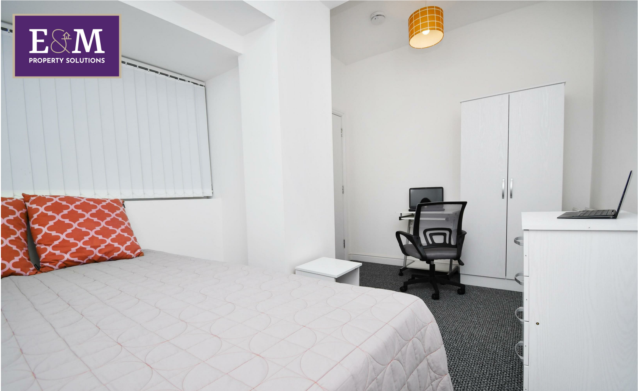
Room 2, 16 Linden Street, Burnley, Lancashire, BB10 4EQ £90 Per week