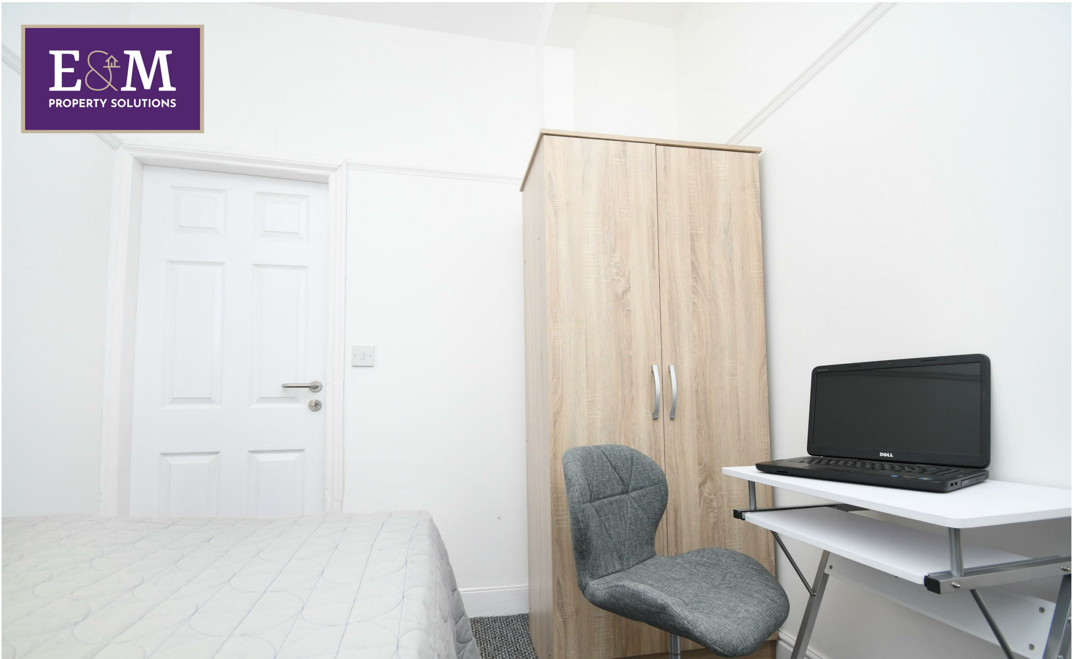
ROOM 4, 11 St. Ignatius Square, Preston, Lancashire, PR1 1TT £105 Per week