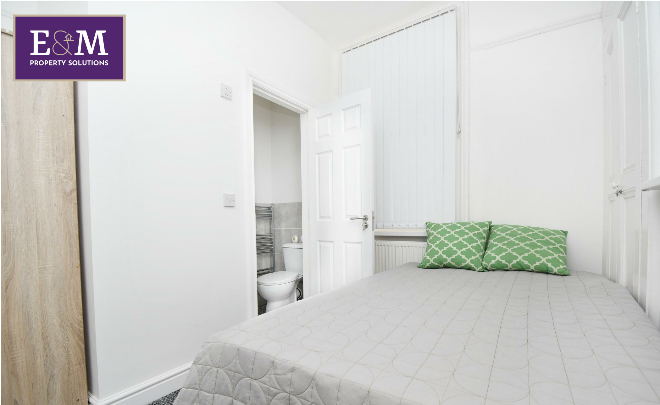
Room 2, 72 St. Matthew Street, Burnley, Lancashire, BB11 4JU £110 Per week