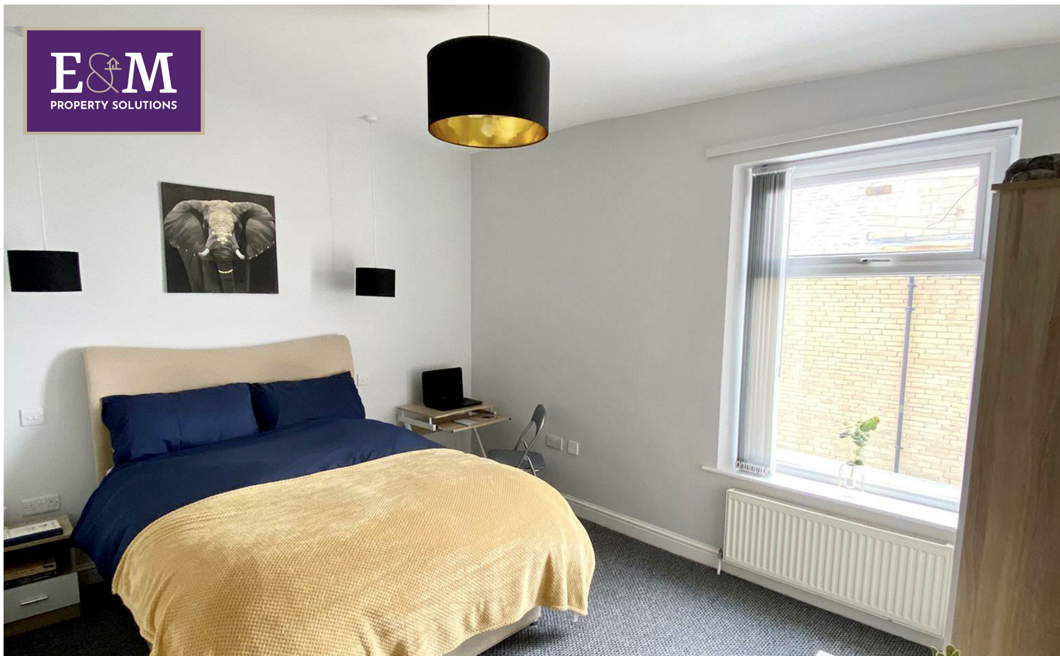
ROOM 4, 63 Coal Clough Lane, Burnley, Lancashire, BB11 4NS £120 Per week