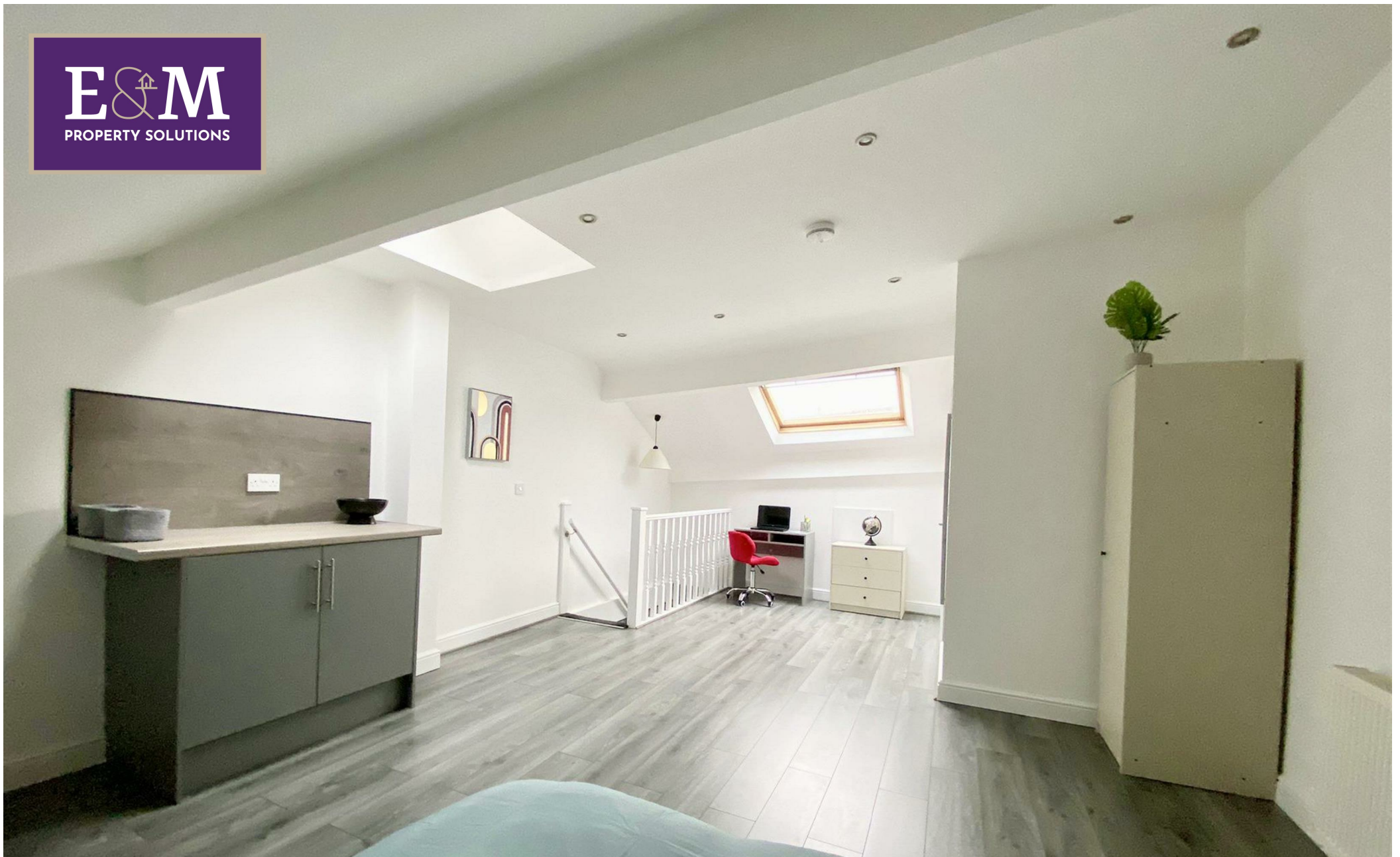
Room 5, 8 Berry Street, Burnley, Lancashire, BB11 2LG £160 Per week