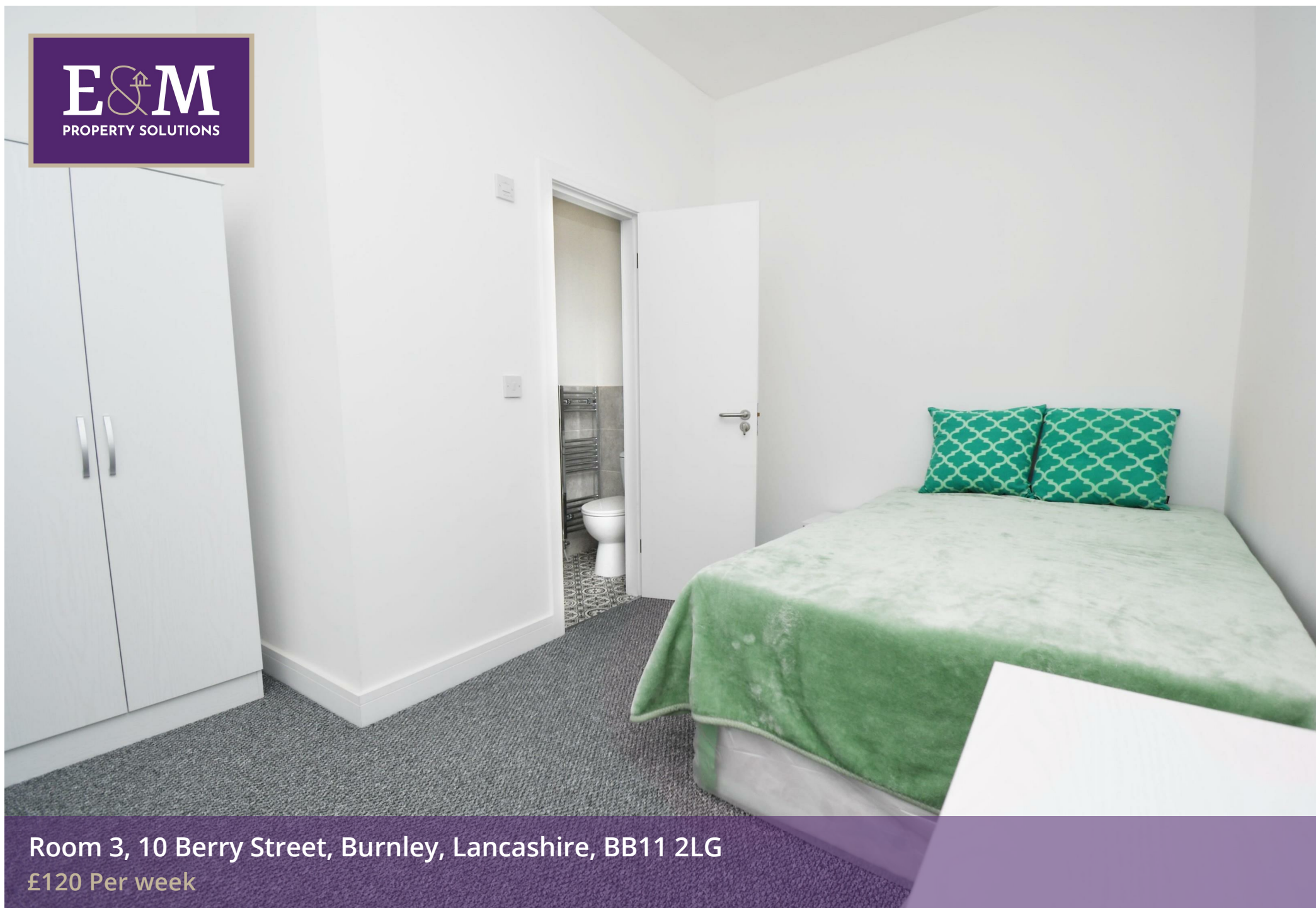
Room 3, 10 Berry Street, Burnley, Lancashire, BB11 2LG £120 Per week