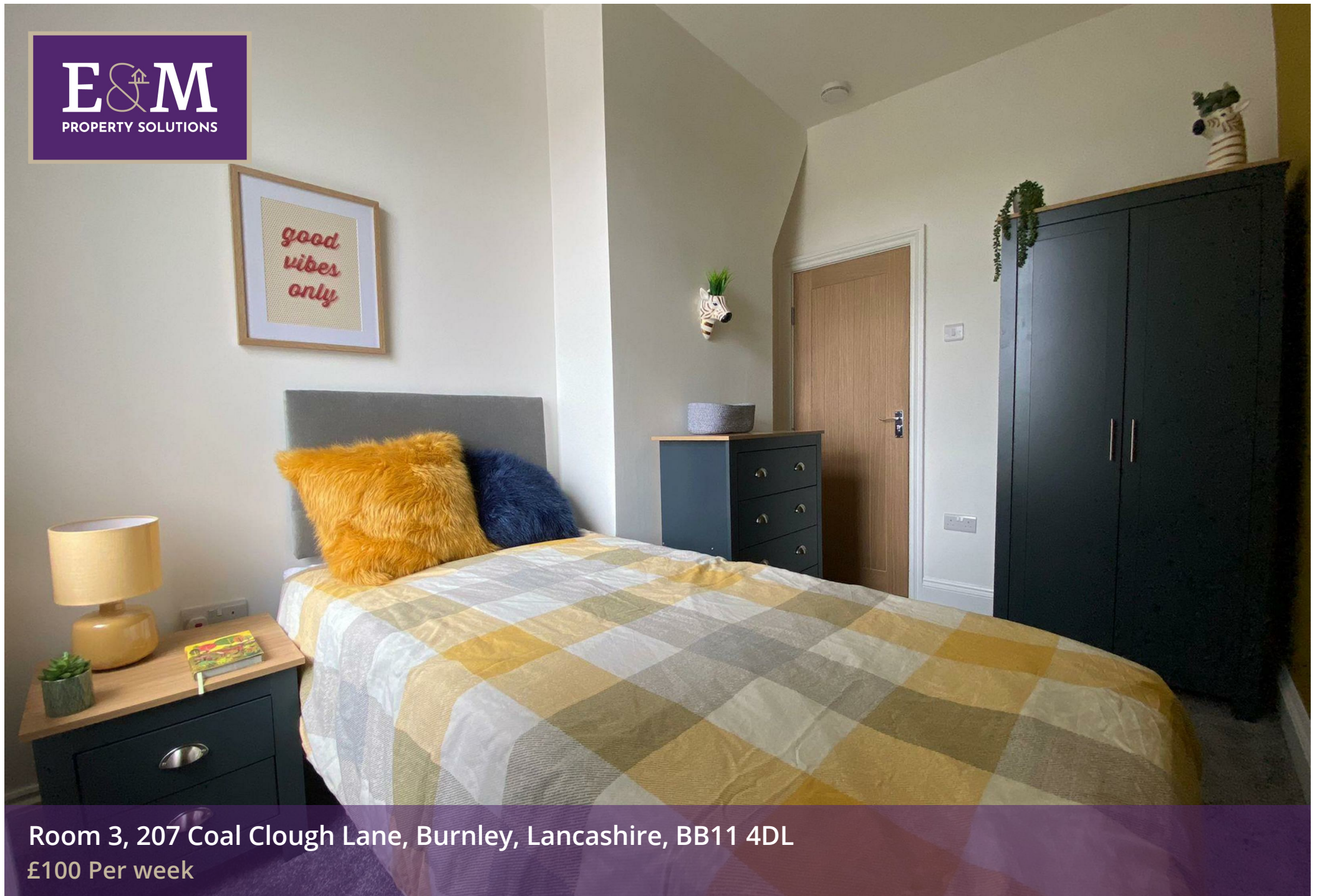
Room 3, 207 Coal Clough Lane, Burnley, Lancashire, BB11 4DL £100 Per week