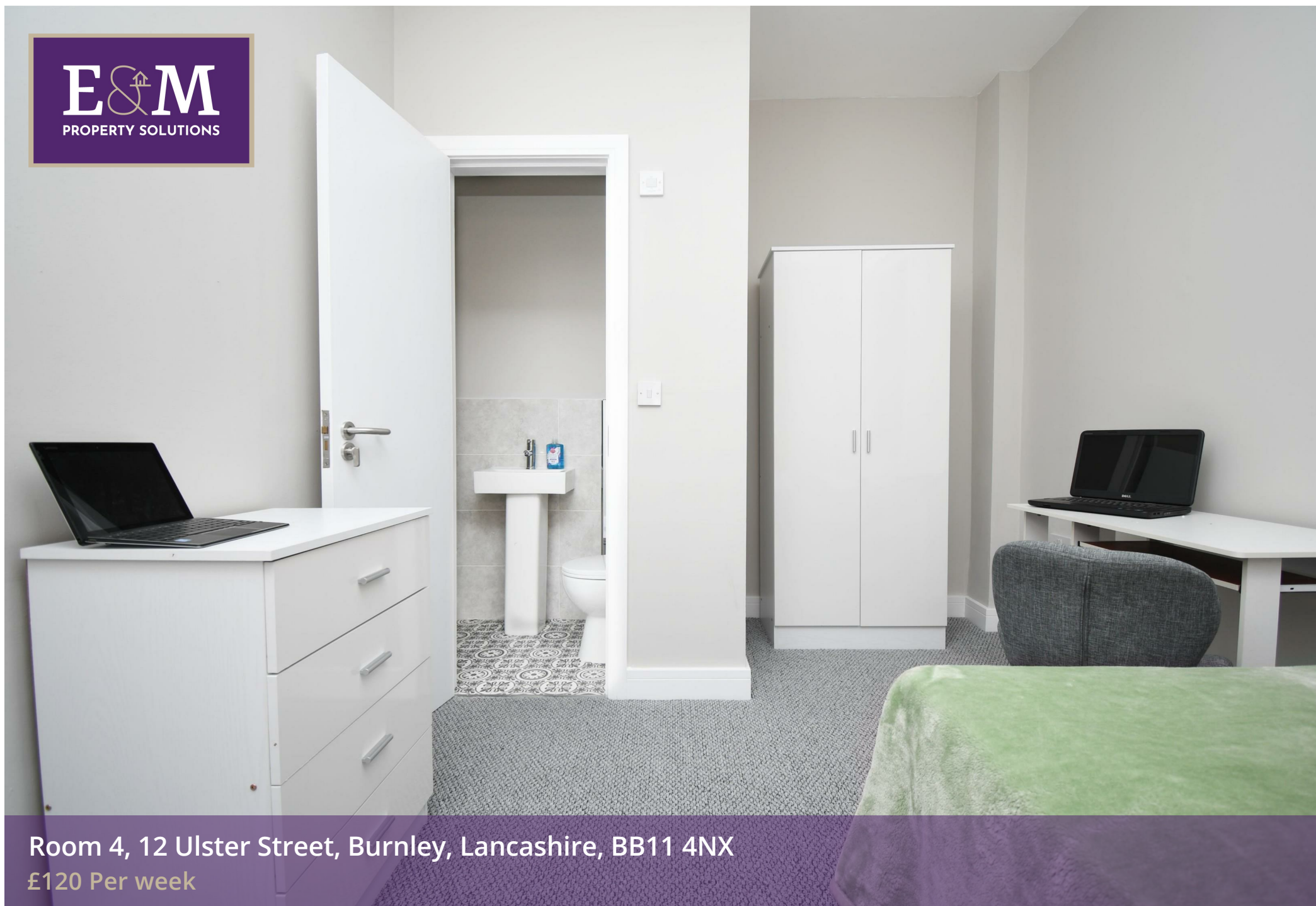
Room 4, 12 Ulster Street, Burnley, Lancashire, BB11 4NX £120 Per week