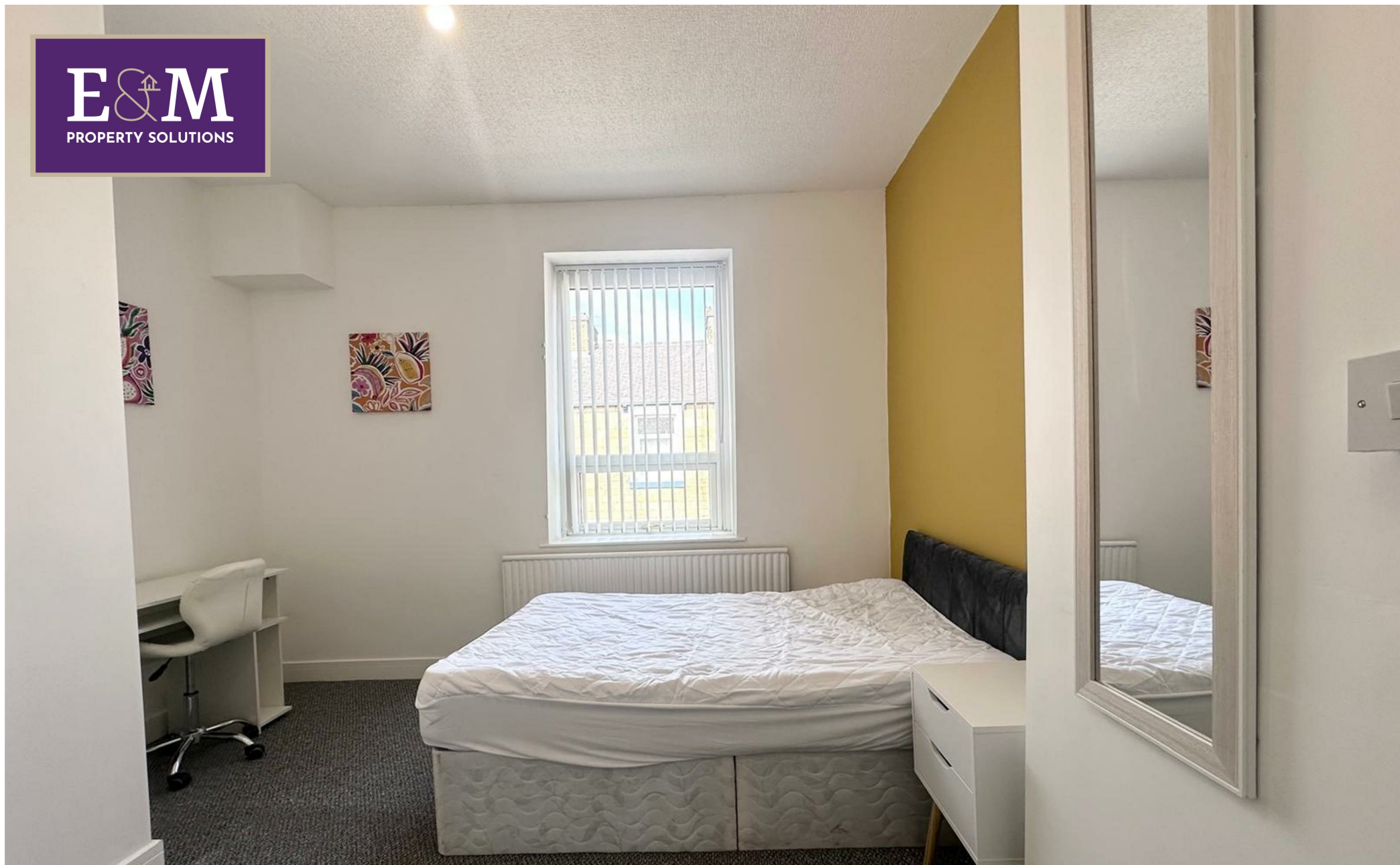
Room 6, 2-4 Fir Street, Burnley, Lancashire, BB10 4AL £115 Per week