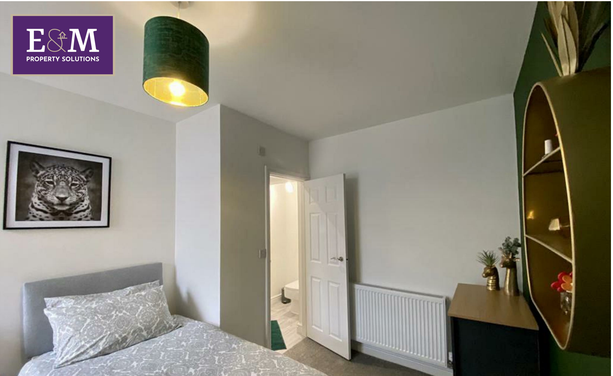
Room 2, 80 St. Matthew Street, Burnley, Lancashire, BB11 4LF £115 Per week