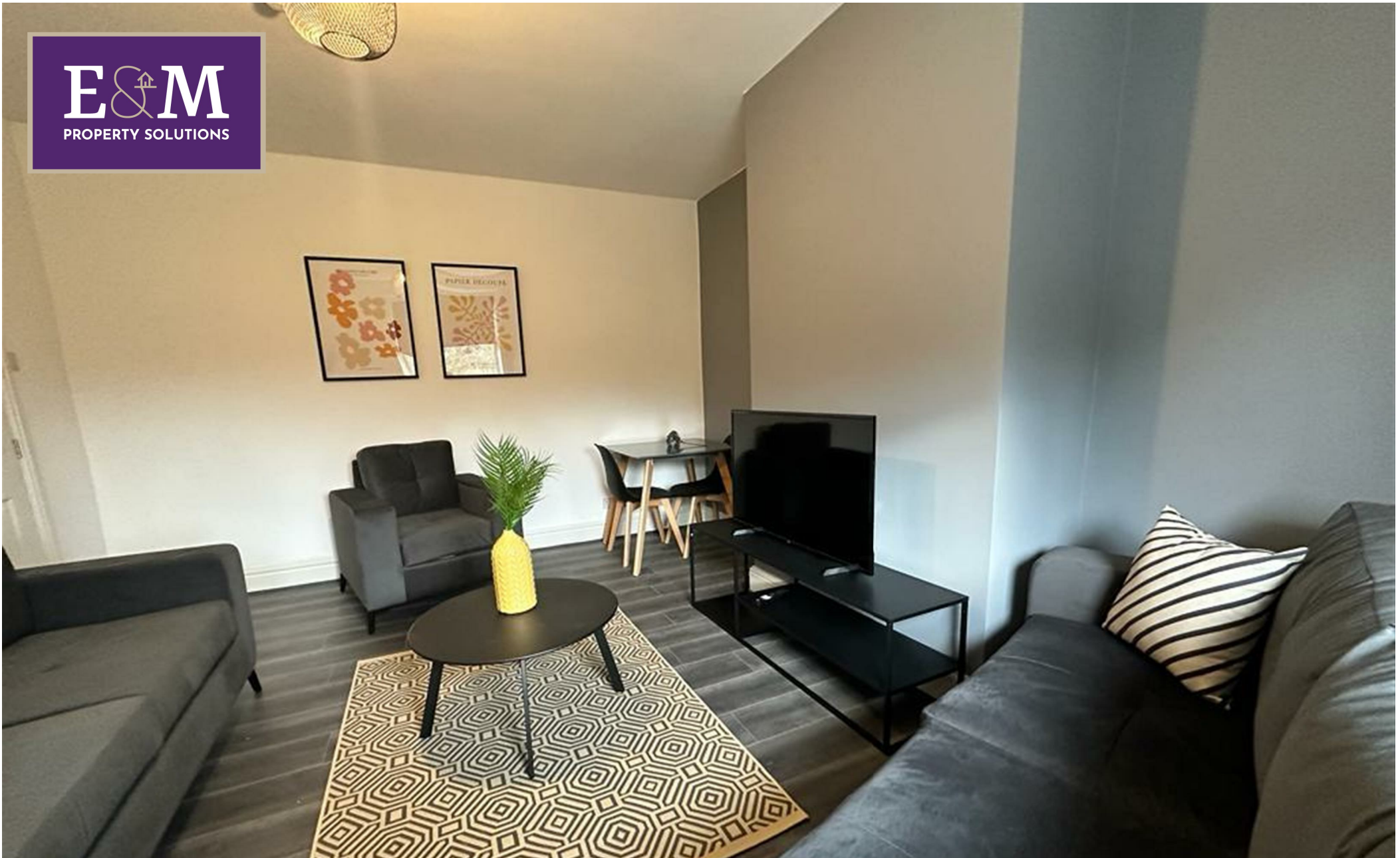
ROOM 1, 2-4 Collinge Street, Padiham, Burnley, Lancashire, BB12 7BA £89 Per week