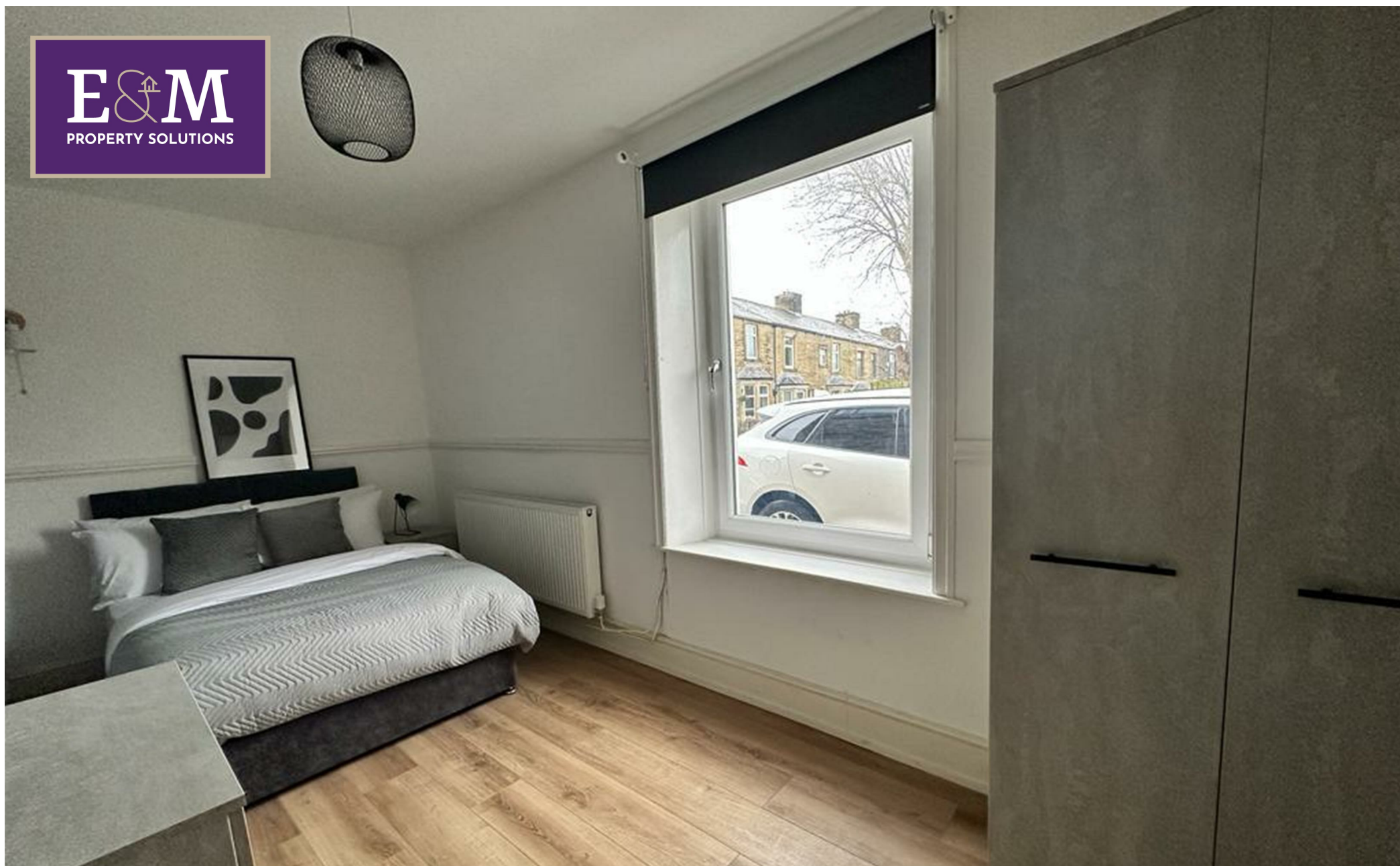
ROOM 2, 2-4 Collinge Street, Padiham, Burnley, Lancashire, BB12 7BA £95 Per week