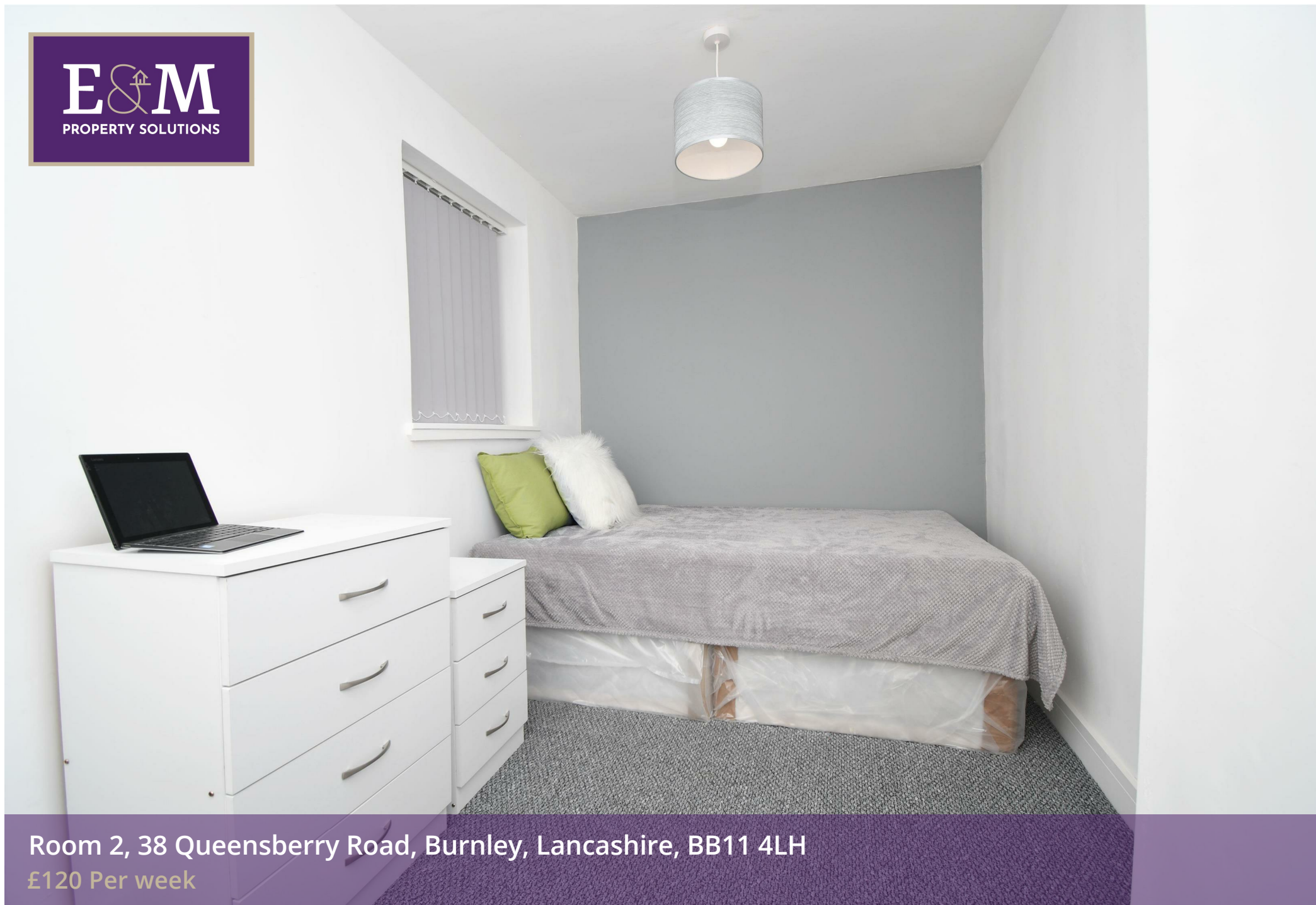
Room 2, 38 Queensberry Road, Burnley, Lancashire, BB11 4LH £120 Per week