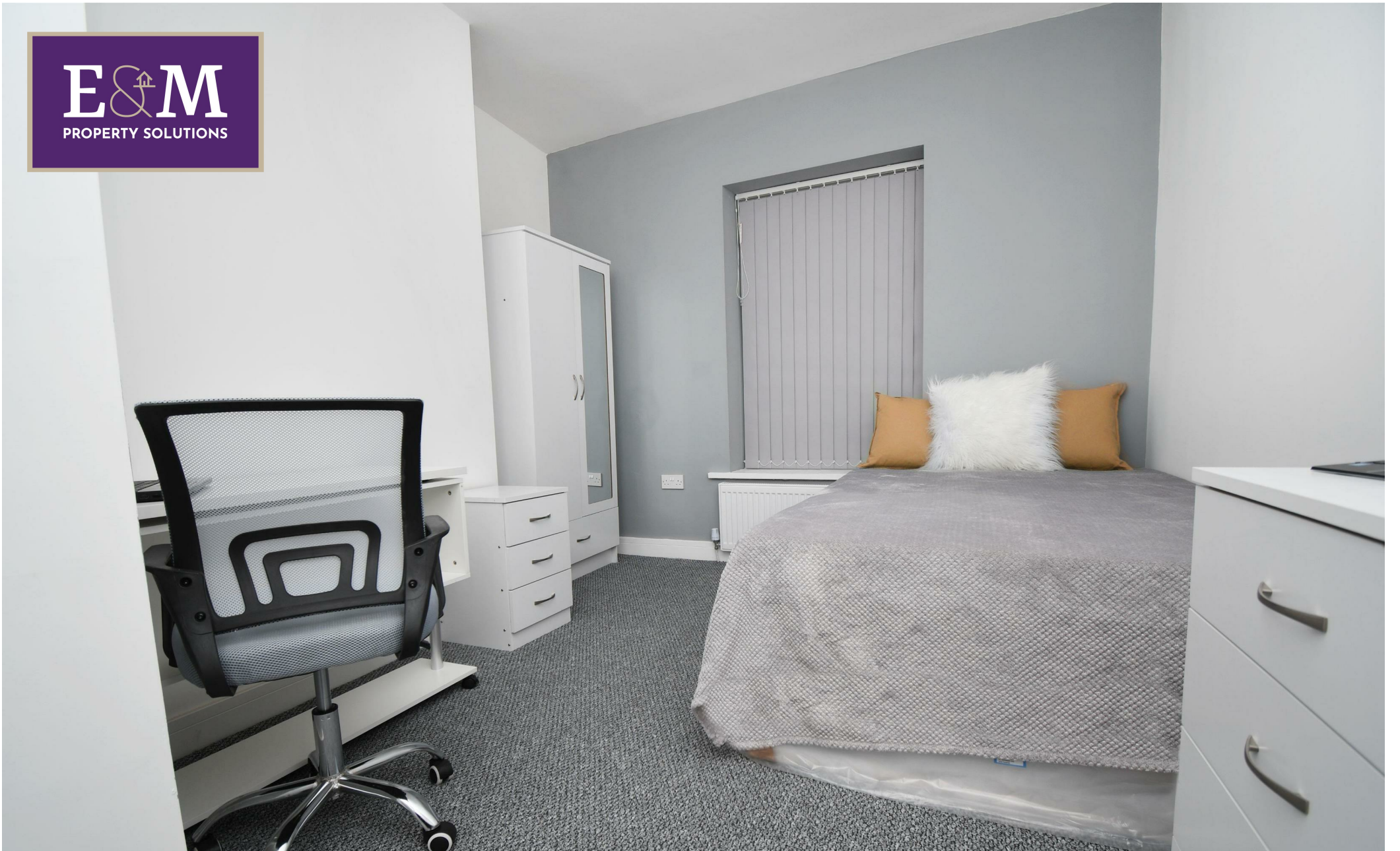
Room 4, 38 Queensberry Road, Burnley, Lancashire, BB11 4LH £125 Per week